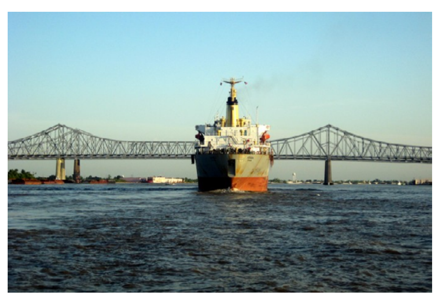
New Orleans: Mississippi River and Crescent City Connection. Photographer Wally Gobetz. Image used under Creative Commons License CC BY-NC-ND.

We asked a diverse group of river people to respond to the prompt "How did you come to know the Mississippi River?" What does it mean, to you, to know the Mississippi River?" We present below a few of the responses, in no particular order.