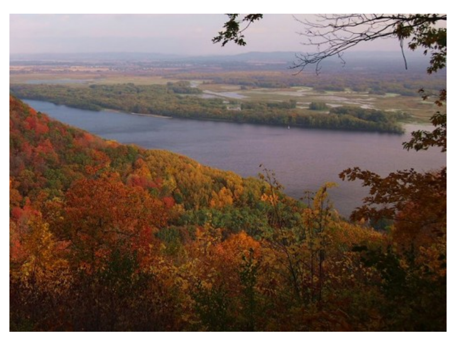
Mississippi River from overlook on campground road, Great River Bluffs State Park, Minnesota, USA. Photographer McGhiever. Used under Creative Commons license CC BY-SA.

We asked a diverse group of river people to respond to the prompt "How did you come to know the Mississippi River? What does it mean, to you, to know the Mississippi River?" We present below a few of the responses, in no particular order.