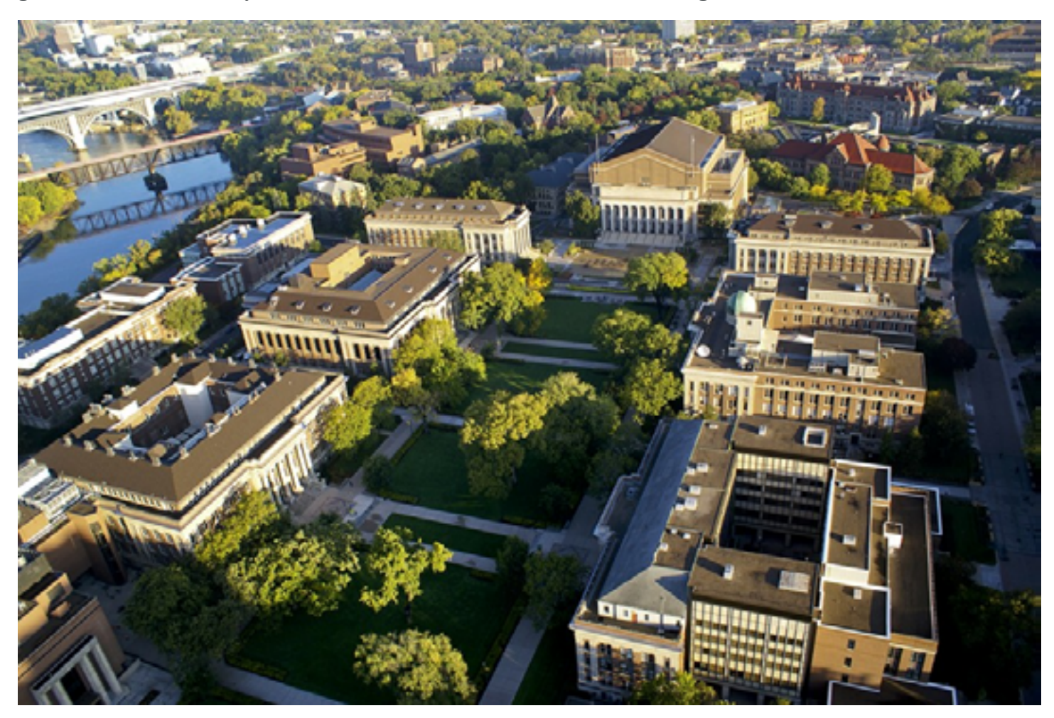
University of Minnesota campus and the Mississippi River.

This is where "river studies" comes in, but challenges remain. Rivers are unarguably complex biological and physical systems, so some instruction from scientific perspectives would seem to be in order. Rivers are also human systems, though, modified in material ways by what people do to them but also affected strongly by the complex webs of meanings and values associated with