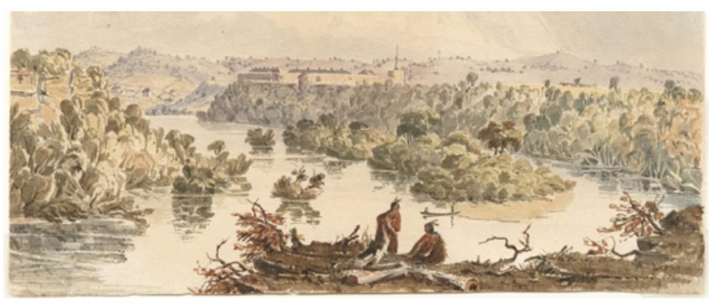
Seth Eastman, Detail of Distant View of Fort Snelling, 1847-49. Watercolor.

iterations, many of the essays and columns in this issue look beyond the Mississippi to consider a wide range of rivers and currents. We hope this breadth will encourage a rethinking of that iconic river through other conduits. The idea for this issue began with a panel, entitled "Fluid Currents: Water, Art, and Ecology," that we co-chaired at the Southeastern College Art Conference in October 2015. Inspired by the conference's host city of Pittsburgh, located at the confluence of three rivers, we wanted to generate a conversation about different ways that artists imagined and represented water conduits and their relationships with human and nonhuman life. Our call for papers received a large number of responses, ranging from the design of Baroque bridges and eighteenth-century fountains to early