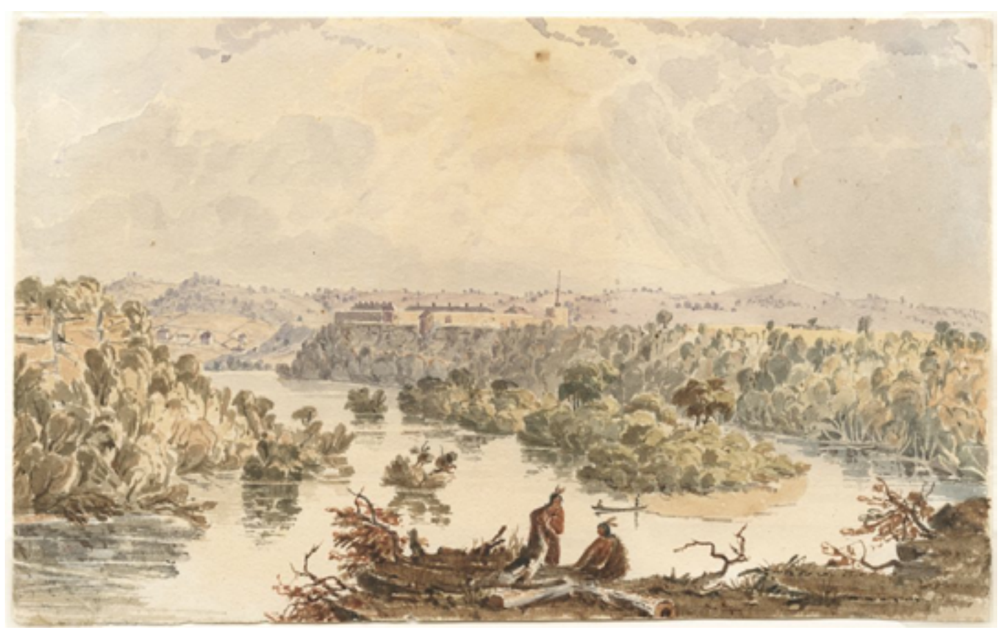
Seth Eastman, Distant View of Fort Snelling, 1847-49. Watercolor. Reproduced by permission of the Minnesota Historical Society.

In the 1830s and 40s, Eastman created hundreds of postcard-sized watercolors depicting the Mississippi River valley. [4] Although they were not seen by many people at the time as such, the watercolors were the building blocks for easel paintings that Eastman exhibited in New York and St. Louis and a popular moving panorama by Henry Lewis that toured the U.S. and parts of Europe, its scrolling movement and theatrical presentation simulating a steamboat tour of the Mississippi. Eastman's views were disseminated even more widely as engravings and lithographs in illustrated magazines, as well as ethnographic and folkloric volumes by Henry Rowe Schoolcraft