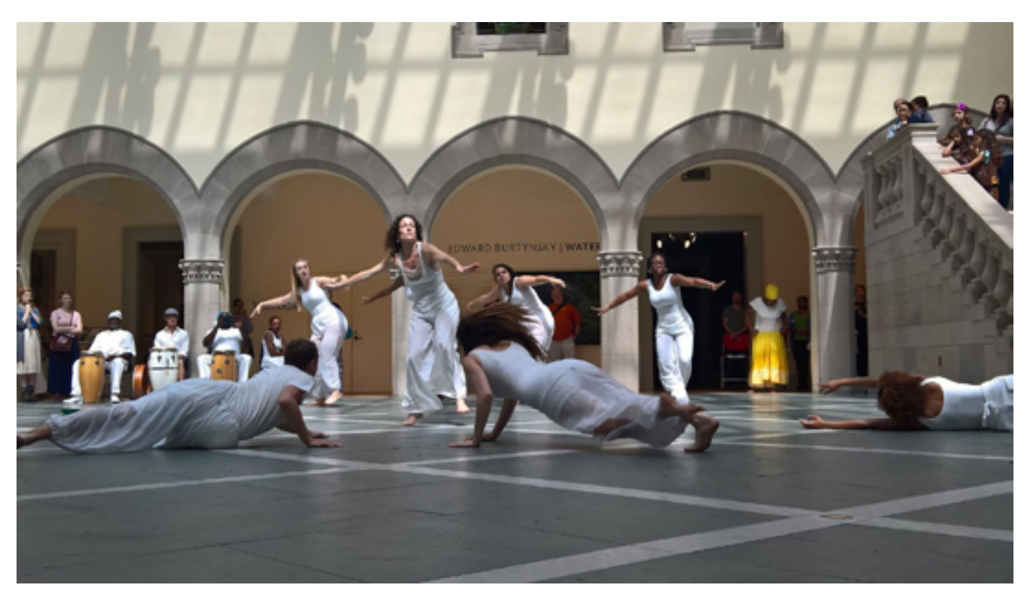
Waters in our Midst.

region's broader preparedness efforts. The City of Norfolk has recently appointed a Chief Resiliency Officer to address flood adaptation issues, and the museum will serve as a forum for strategizing city-wide flood mitigation initiatives. The museum has also begun participating in the Norfolk Resiliency Office's outreach programs, like those teaching residents how to reduce rainwater flooding through landscaping and rain-capture devices. Again working with the city, the museum has helped write a National Endowment for the Arts grant for a public art project that will respond to sea level issues and a museum representative will serve on the selection committee. Finally, the museum education team will design its annual summer camp as a STEAM (science, technology, engineering, arts, and mathematics) program that investigates water in all its forms, and the educators will lead programs at a new statewide charter school that challenges participants to design a museum capable of embracing and responding to water.