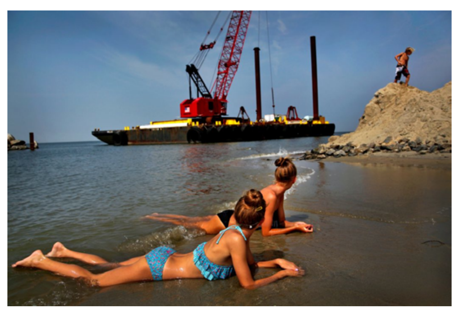
Preston Gannaway (American, b. 1977), Twins, 2013, from the series Between the Devil and the Deep Blue Sea.

Working with Virginia Sea Grant, Old Dominion University, and the Hampton Roads Planning District Commission, the museum also hosted the Adaptation Forum, a quarterly meeting designed to bring together flooding adaptation