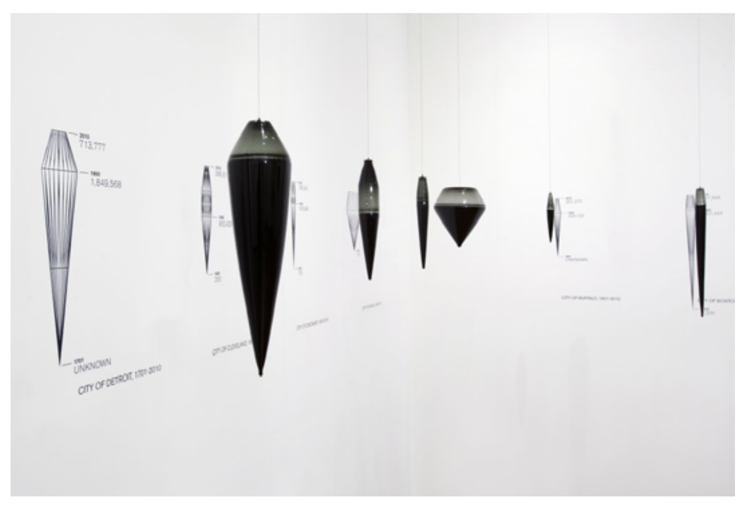
Norwood Viviano (American, b. 1972), installation detail of Cities: Departure and Deviation, 2011, blown glass and vinyl cut drawings.

The museum hosted two unique movement performances that investigated the theme of water from symbolic and religious perspectives. In Water Relics , a performance choreographed by dance professor Megan Thompson and theater artist Jenifer Alonzo, dancers led visitors through