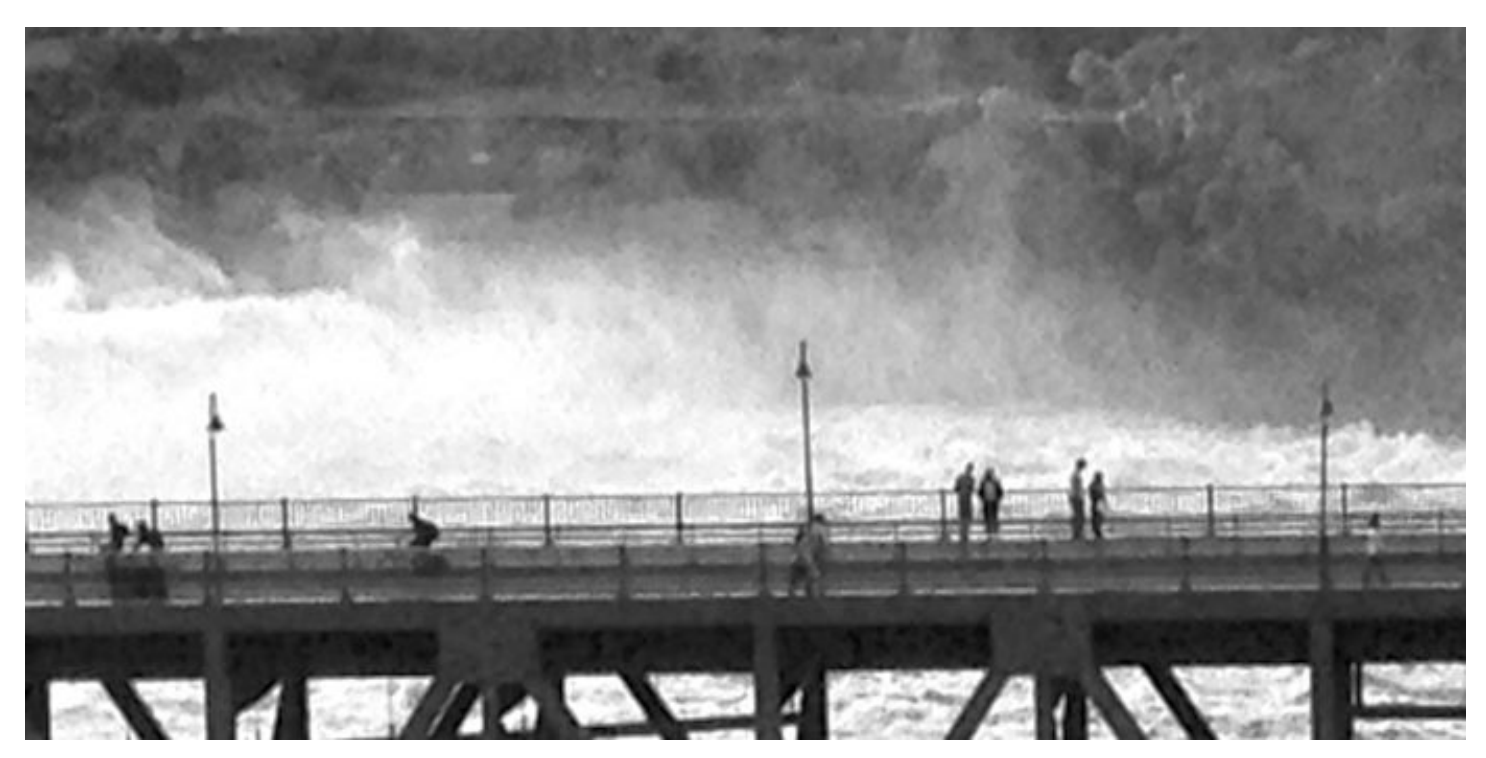
Morning mist at St. Anthony Falls.

spent time at the falls with a Dakota elder whose name connects her to Owámniyomni . She helped me feel the power of the falls that continues, that is stronger than human power. Then I could see and feel that at the bottom of the smooth slide down the human made part of the falls is the whirling water, the spray, the energy and power of the falls. The falls are manufactured, but the water's spirit endures. Now I recognize why I feel clearer and soothed and somehow energized each time I spend time in the St. Anthony Falls area. I can't provide specifics, but the water of the river looks and feels different to me since spending time there with her. I see an indescribable spirit