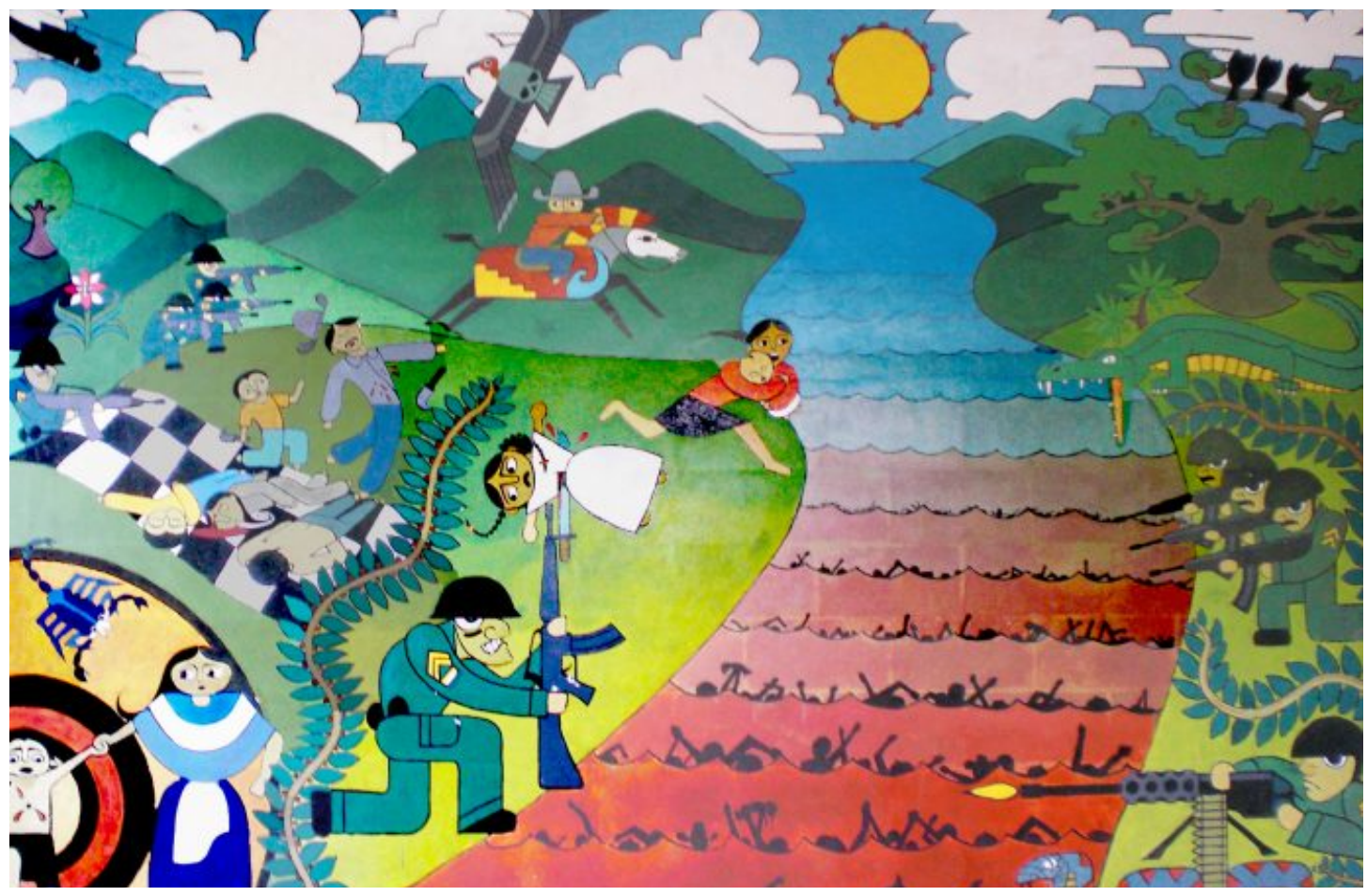
Rio Sumpul Mural. 2010. Arcatao, El Salvador.