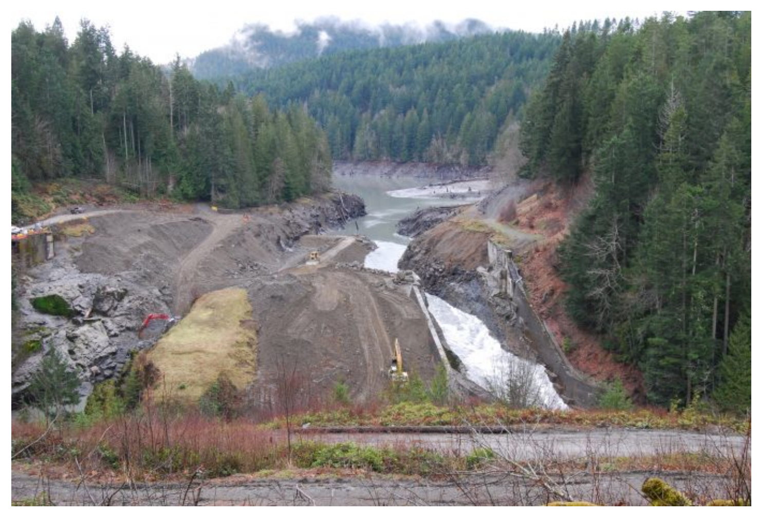
What little remained of the Elwha Dam as of February 14, 2012, by Ben Cody.

is increasing in places like the Missouri River where endangered species are part of the river system. Conflicts emerge when multiple purposes are mutually exclusive. Managers may want to