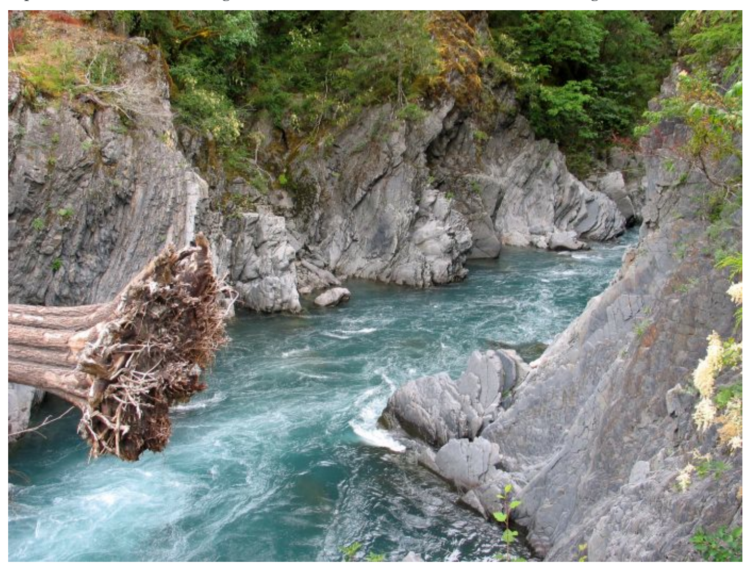
Elwha River at Goblin's Gate

But things have changed recently. According to "The Undamming of America," some 500 dams have been removed in the United States over the past decade. Even more unusual, a recent program from The Nature Conservancy and the US Army Corps of Engineers, the Sustainable Rivers Program (SRP), seeks to alter the function of dams to increase the ecological functions of