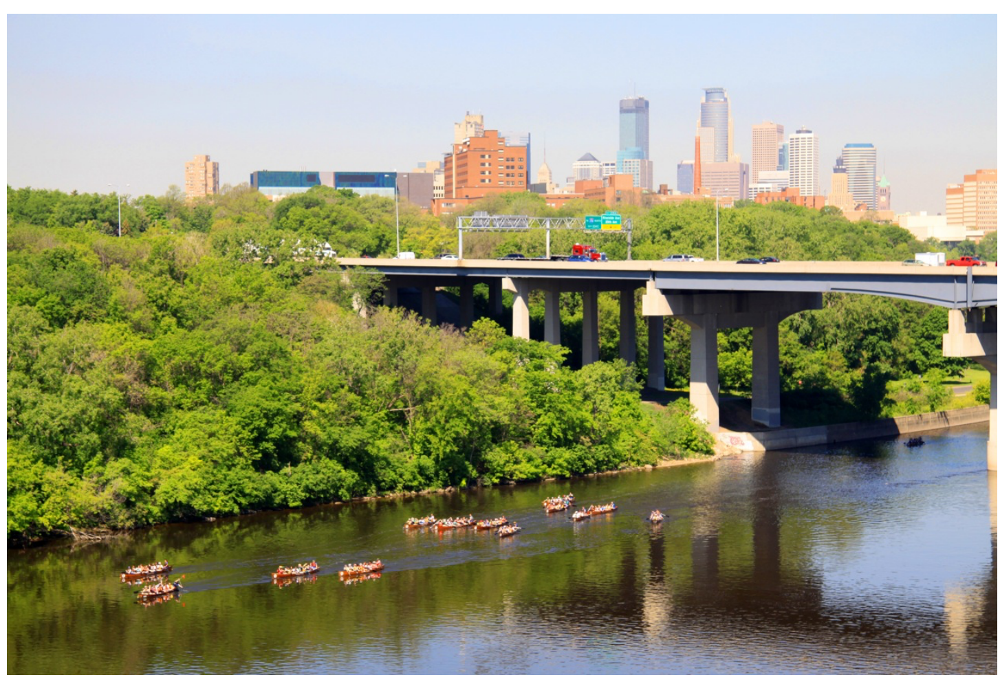
Canoeists on the Mississippi River in the Mississippi River National River and Recreation Area.

most people think of national parks, they imagine Yellowstone, the Grand Canyon, the Everglades, the Statue of Liberty, or some other iconic park or place. I realize this is a gross generalization. Most