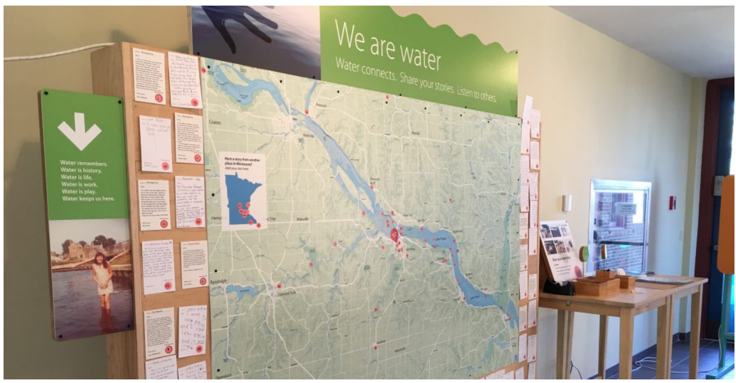
The We are Water display encourages examination of the stories of nearby water landscapes, as well as inspires the visitor to contribute his or her own story.