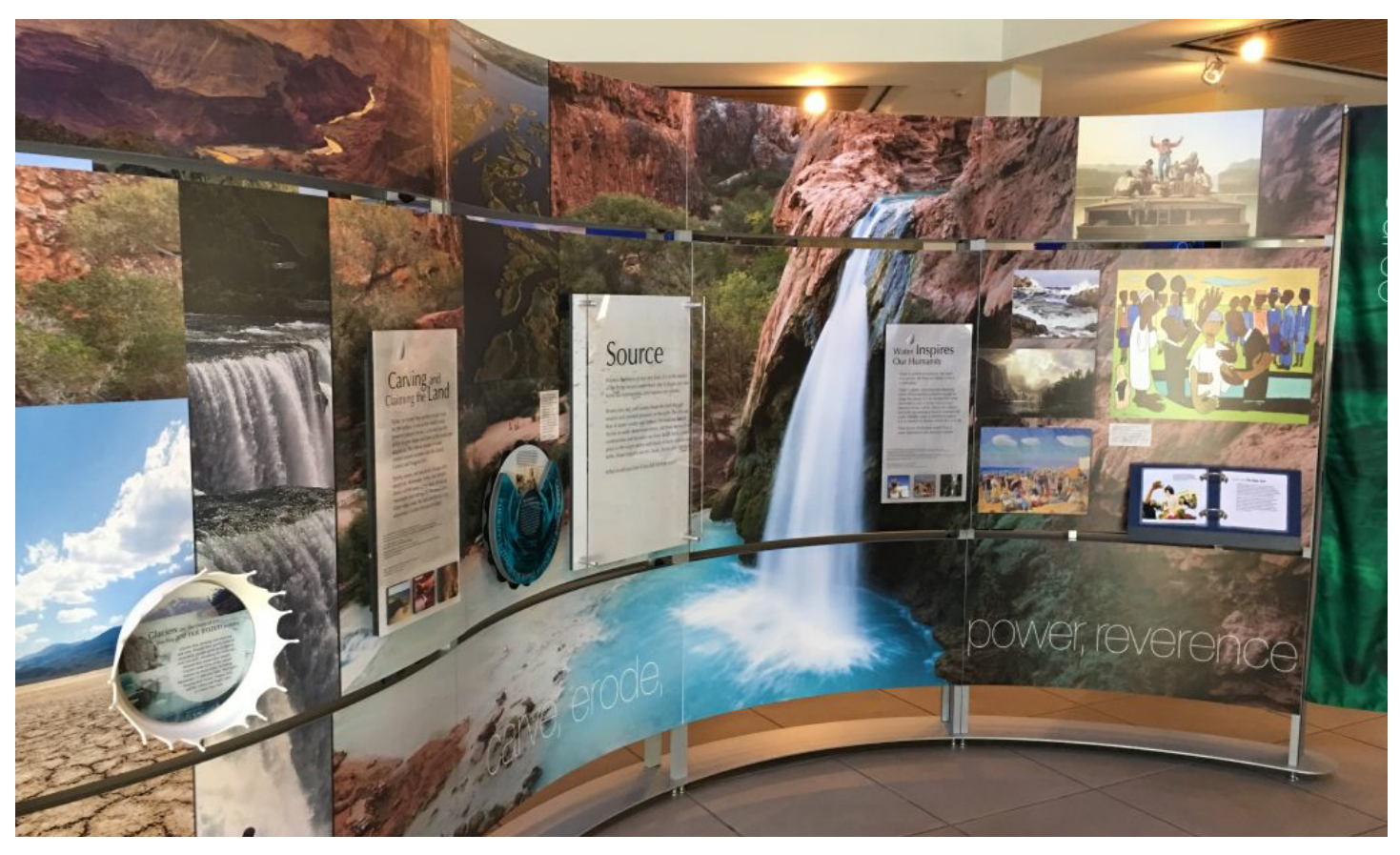
Not merely blurbs of text, the rich imagery and interactive displays keep the information fresh and varied.