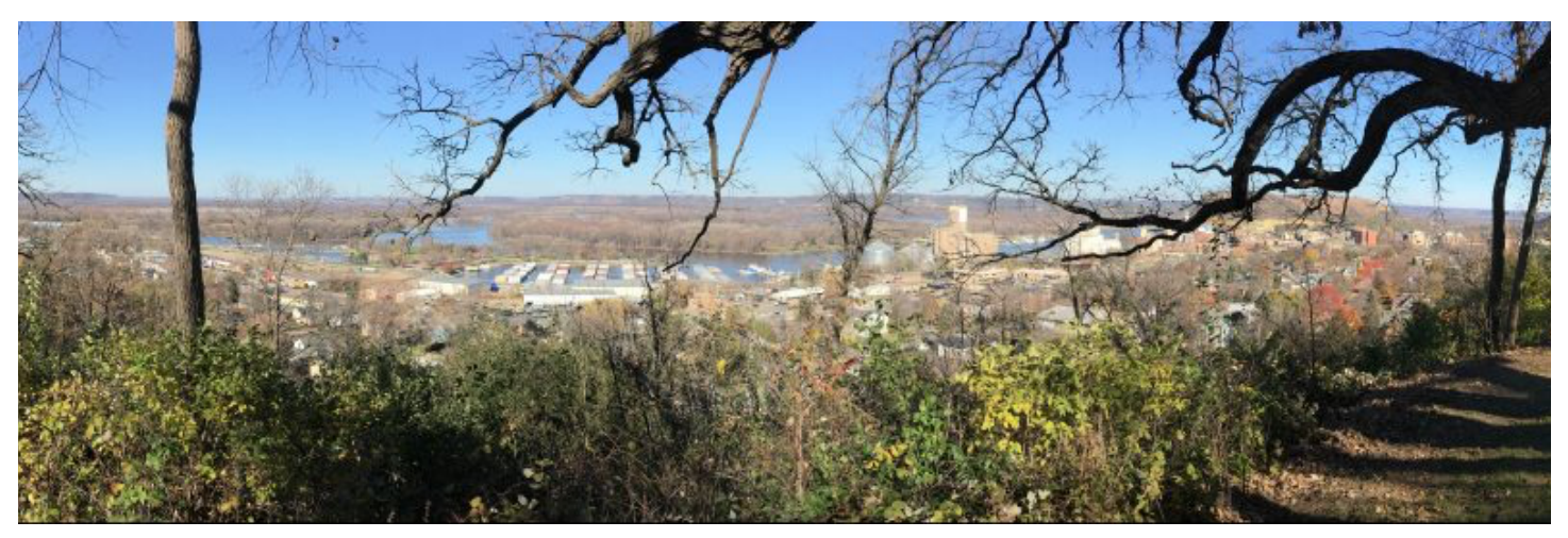
View of Red Wing and the Mississippi River from the Goodhue County Historical Society.

The main part of the exhibit, from the Smithsonian, was formed of dramatically curving panels in the atrium of the historical society. Methodically, not wanting to miss anything, I started at one end and tried to fully experience each panel before I moved on to the next. The richness, variety, and layers of information