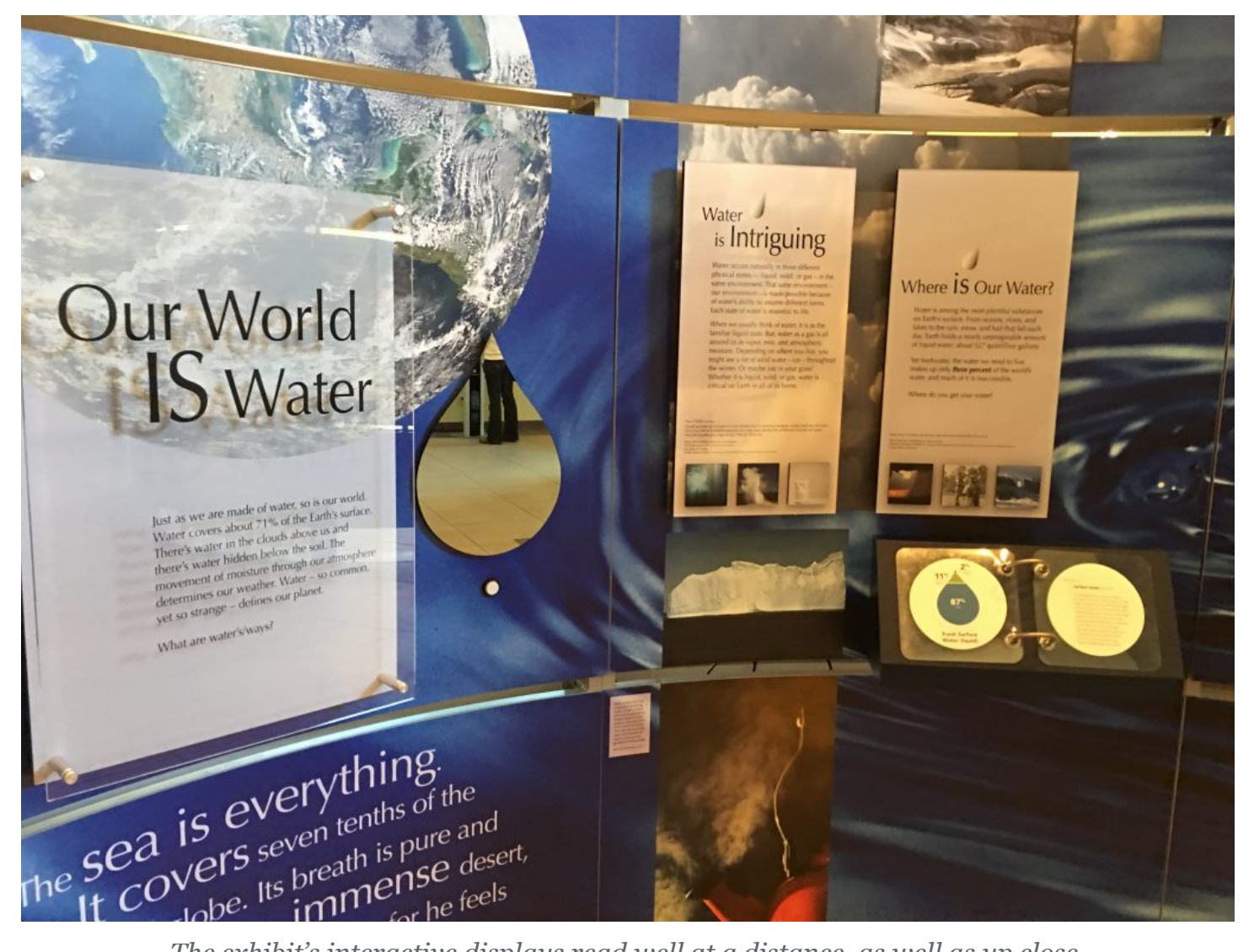
The exhibit's interactive displays read well at a distance, as well as up close.

The statewide partners provided a mapping exhibit called We are Water , which allows the visitor to read personal stories about the water landscape adjacent to Red Wing, and to contribute his or her own stories directly on the map. I contributed one, but it was unclear from the exhibit whether this would be preserved in perpetuity, or if the stories would be ephemerally wiped away with each successive generation of visitor.