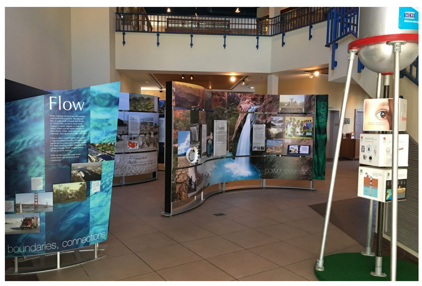
Water/Ways exhibition in the atrium of the Goodhue County Historical Society.

Partners involved in Minnesota's exhibitions include the <u>Minnesota Humanities Center</u>,