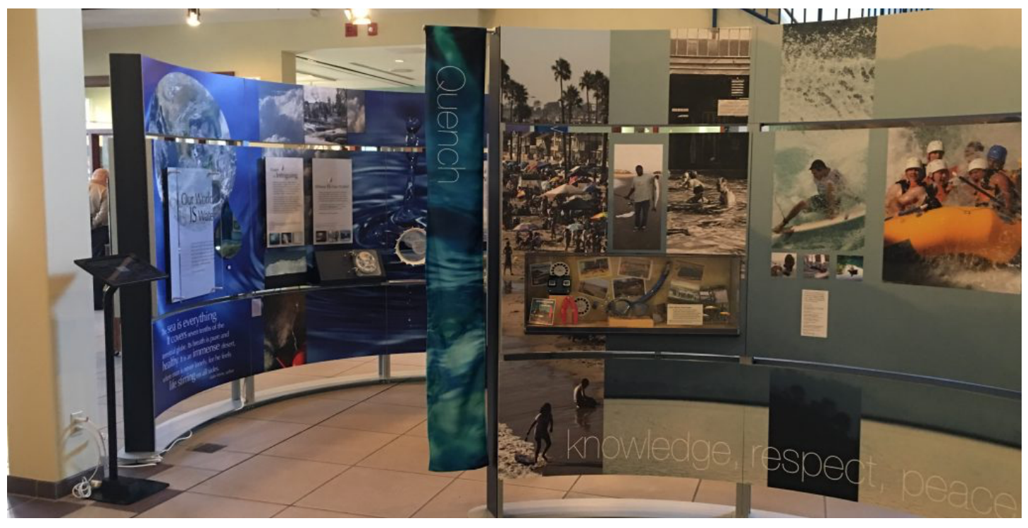
The curved panels of the exhibition create spaces for exploration.