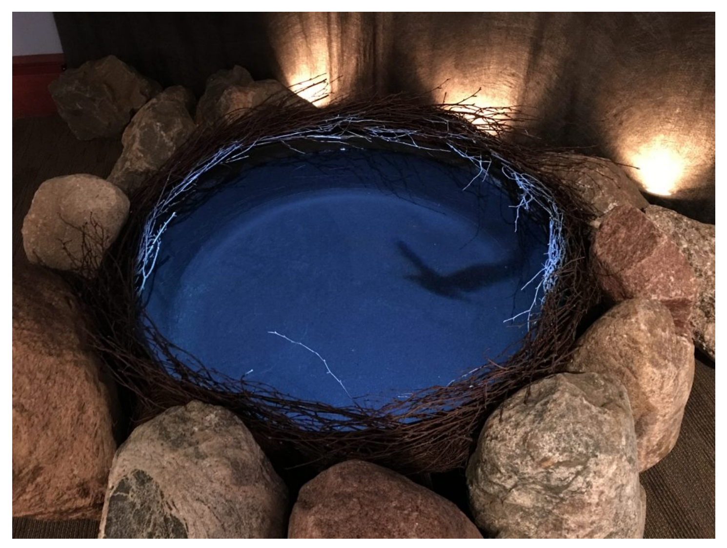
<u>Cloudy Waters</u> is also on permanent display at <u>Mill City Museum</u> and <u>The Science Museum of</u> <u>Minnesota</u>.

Water/Ways is thoughtful, detailed, complicated, and accessible, and the opportunity it has provided for partner institutions to develop additional exhibitions is extraordinary. The addition of the Goodhue County Historical Society's new permanent exhibit is an enduring reminder that water issues are not fleeting, but are ongoing, and is well worth a visit long after Water/Ways has moved on.