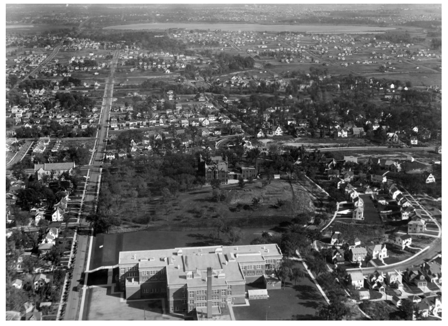
Aerial view of South Minneapolis looking east toward Lake Nokomis from Washburn High School circa 1928.

Augsburg College undergraduates on a history quest at the Hennepin County Government