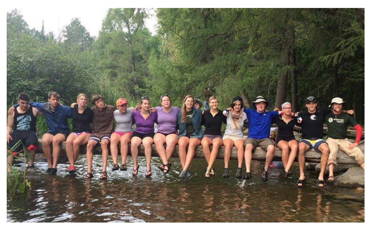
Students in the Augsburg River Semester Program at the Headwaters of the Mississippi River, Lake Itasca, South Clearwater, MN.

The basic structure of the college classroom and curriculum entails a controlled space, a set curriculum drawn from a specific academic discipline, an authority structure based on the doctorate,