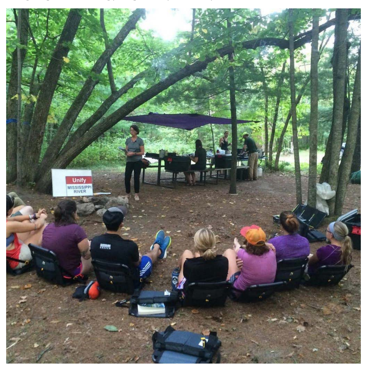
On the River Semester Program, the classroom is everywhere. Learners here are enjoying their first guest lecture at Itasca.

To be instead on the Mississippi River for over 100 days is a different kind of education (and life)