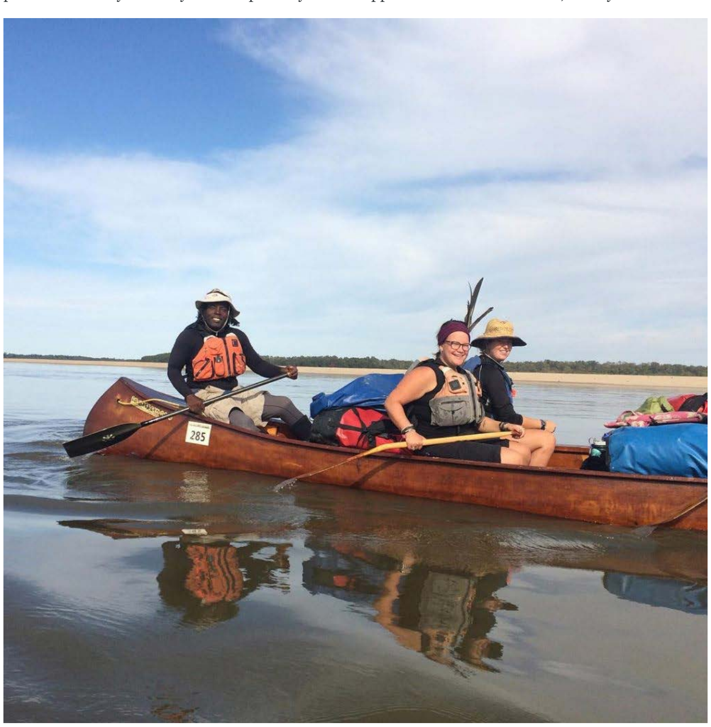
Paddling on the Mississippi River to Choctow Island.

Another recalled that, "When you talk to people who have lived on the river or who have been part of the river for their whole lives you learn about so much more than history and science. The river shapes lives." The students expressed appreciation for the fact that, "Everyone is the