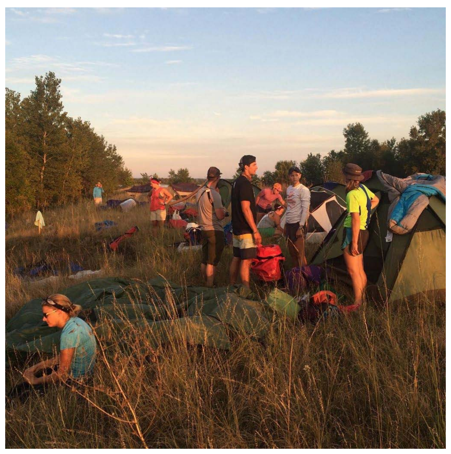
Setting up camp at Pool 5 Weaver Bottoms.

The passage reflects the student's sense of awakening to the challenges and responsibilities of adulthood, the sense of connection to each other as a family, self-awareness, and at the same