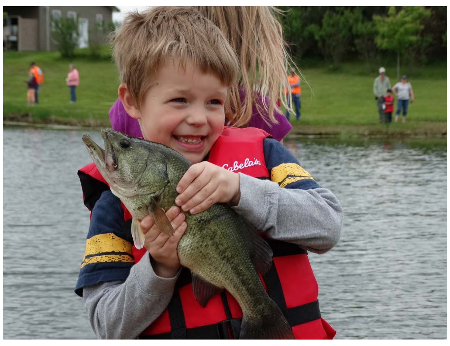
A kid catches a big one at the annual "Take a Kid Fishing Day" near Northfield.