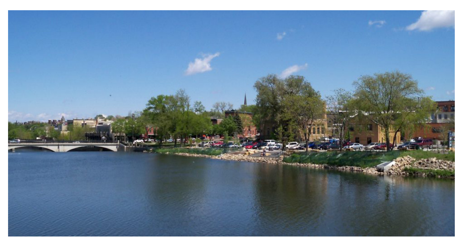
The Cannon River riverfront in Northfield, Minnesota.

CRWP is a small, but mighty nonprofit membership organization with a focus on clean water. Our geographic focus is the land that drains to the Cannon and Straight Rivers, which means the map of our area is unlike that of any you may be used to seeing. We consider six counties that make up the majority of the watershed—Dakota, Goodhue, LeSueur, Rice, Steele, and Wasecaalong with their Soil and Water Conservation Districts (SWCDs), to be our primary partners in local government. We regularly work with these entities, as well as with city and township governing bodies, to accomplish work in our area. We also partner with state agencies, such as the Department of Natural Resources (DNR) on Wildlife Management Area projects, the Board