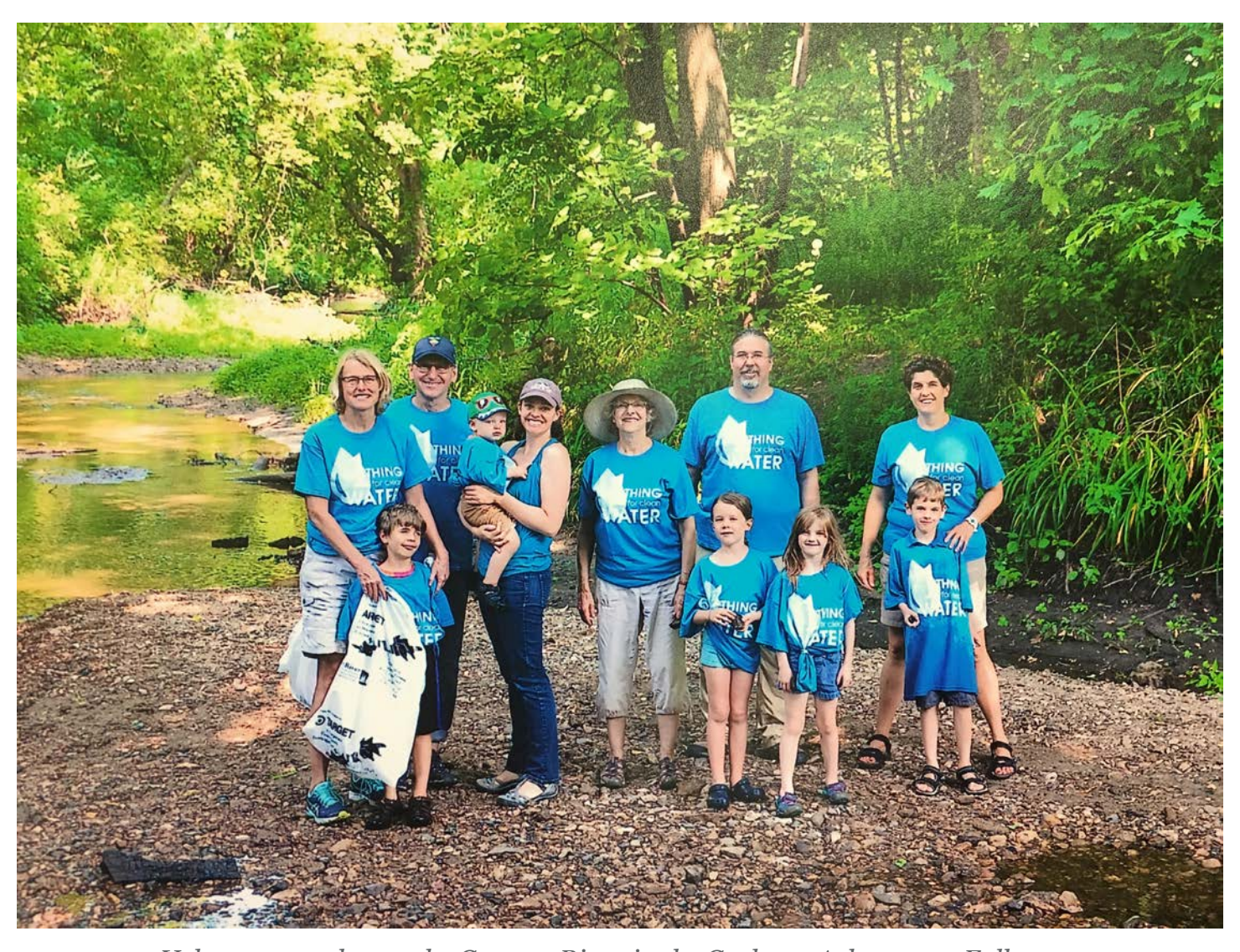
Volunteers gather at the Cannon River in the Carleton Arboretum, Fall 2017.