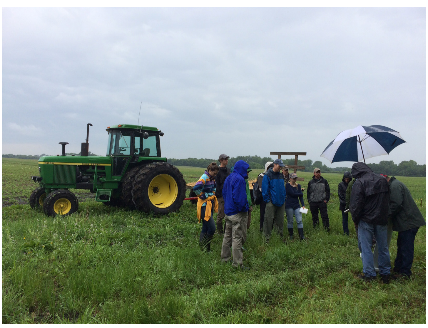
Field day on a local farm on Mud Creek, summer 2017.

Our rural communities are becoming more and more diverse and, although this can be a point of friction for a community of any size, water by its very nature creates spaces where we can all gather and unite. For example, on one Saturday morning each September, CRWP hosts a Watershed-Wide Clean Up at around a dozen