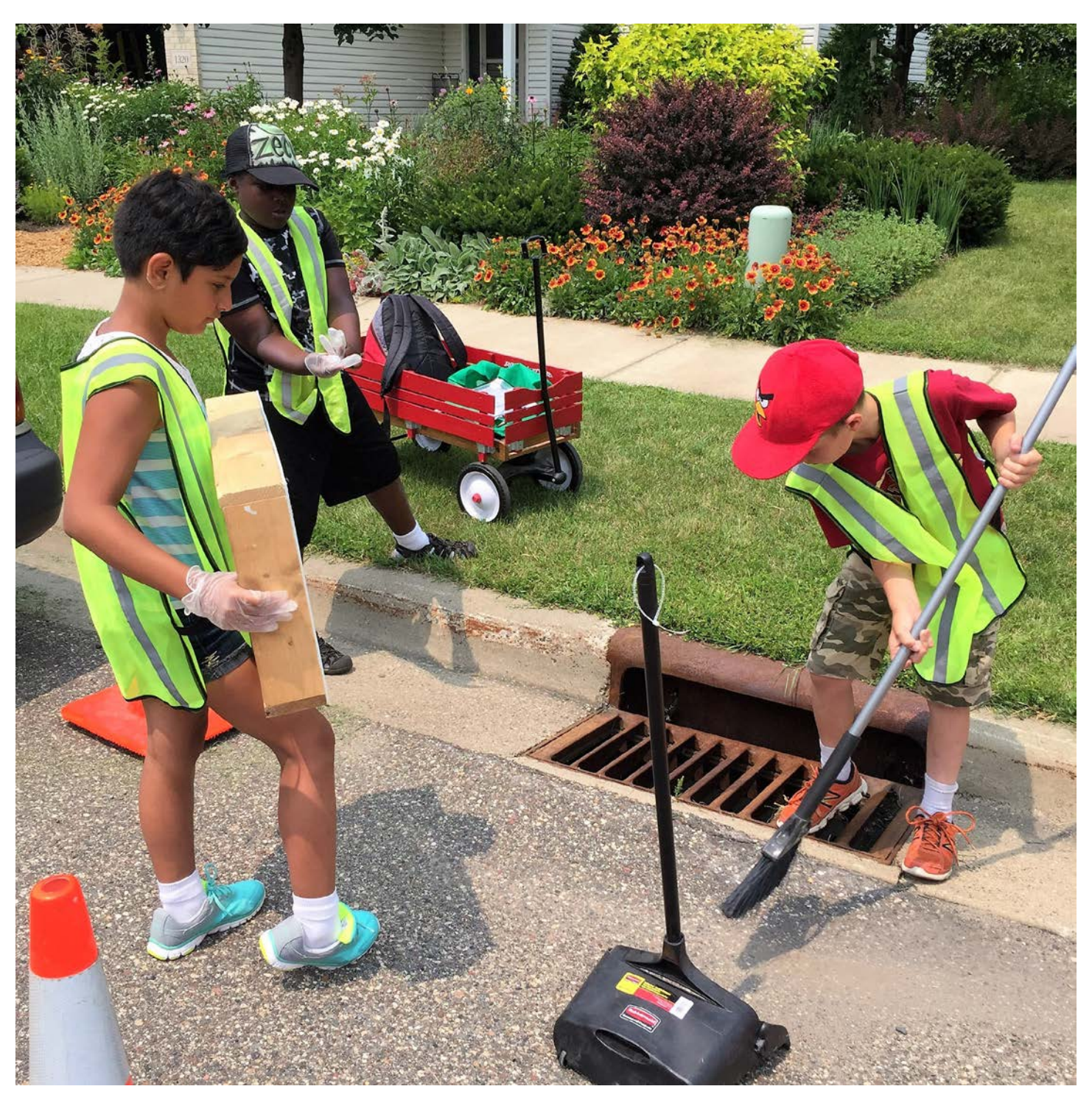
Northfield youth sweep clear then stencil stormdrains that empty into the Cannon River.