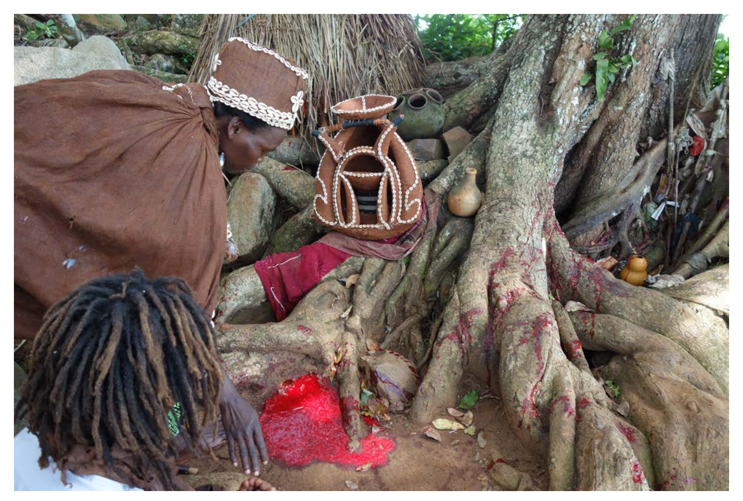
Fig. 6. Blood sacrifice to the rain-god Mesoké in the Itanda Falls.

See the video Sacrifice to the Nile River.