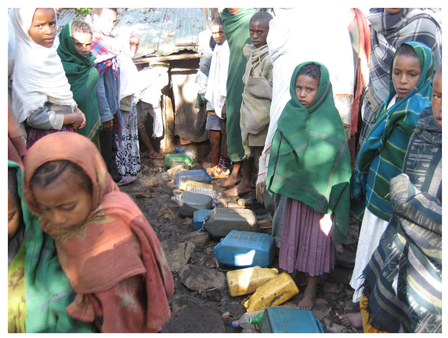
Fig. 2. Gish Abay or the Source of the Blue Nile in Ethiopia.

headwaters. The name of the first is the Pishon; it winds through the entire land of Havilah, where there is gold. The name of the second river is the Gihon; it winds through the entire land of Cush. The name of the third river is the Tigris; it runs along the east side of Asshur. And the fourth river is the Euphrates. (Genesis 2:11–14)