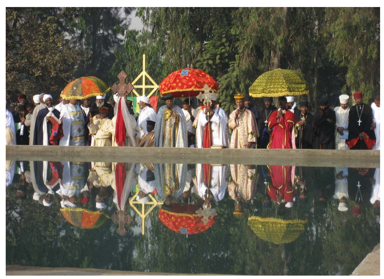
<u>Timkat, Ethiopia, 2010.</u>

While these questions were geographical in the nineteenth century, in the preceding centuries