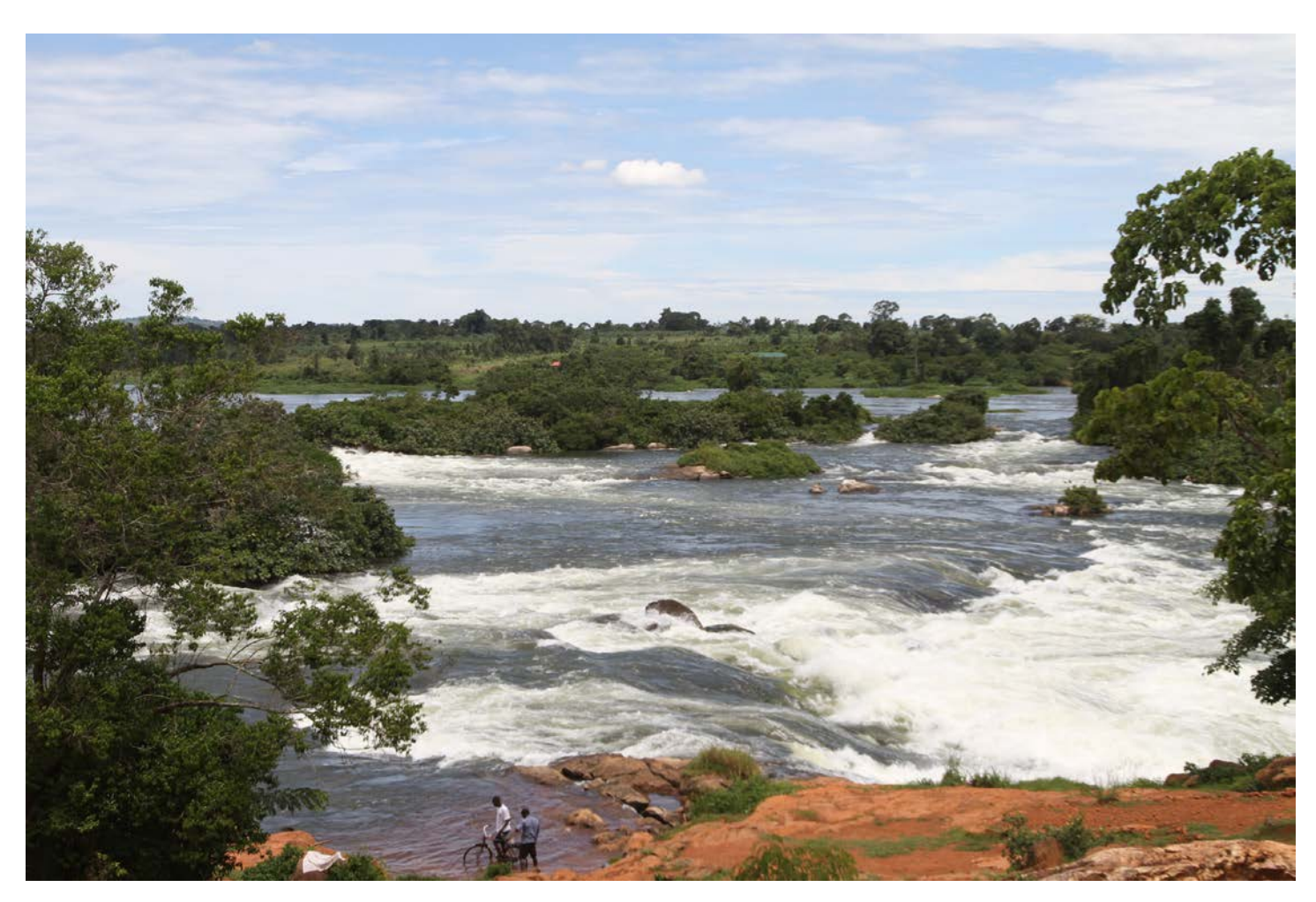
Fig. 4. Itanda waterfalls.

raw and brutal water-powers are in nature, the stronger the river-gods are believed to be.[12] At the historic source at the outlet of Lake Victoria (Fig. 3), there is a subterranean source in the middle of the river creating a counter-current seemingly rising from the Ripon and Owen Falls. According to those still believing in the traditional Busoga cosmology, this unnatural or supernatural phenomenon was a testimony to the force of the river spirit Kiyira. The most powerful spirit was living in the next waterfalls, the Budhagaali spirit in the Bujagali Falls. The force and sound of the Bujagali Falls give testimony to the powers of the Budhagaali spirit and it is truly a river spirit. Still, it moves freely around on land and wherever it wants; after all, gods are gods, spirits are spirits, and humans are humans; but unlike transcendental gods like God or Allah