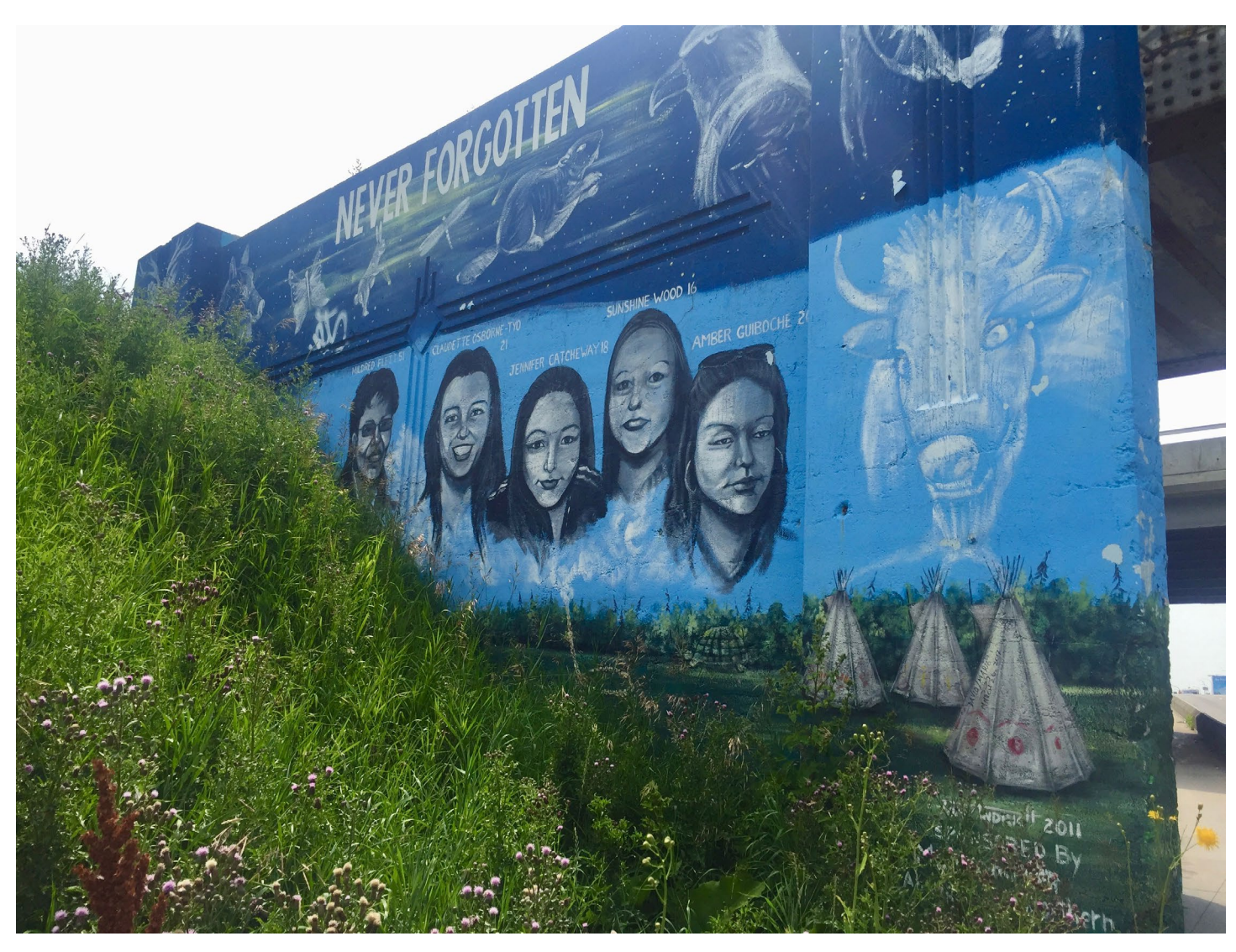
Mural for MMIWG by Tom Andrich on Portage Ave in Winnipeg.

While Indigenous women and girls are subjected to specific forms of gendered and sexualized colonial violence, Indigenous men and boys are also being murdered and disappeared. In