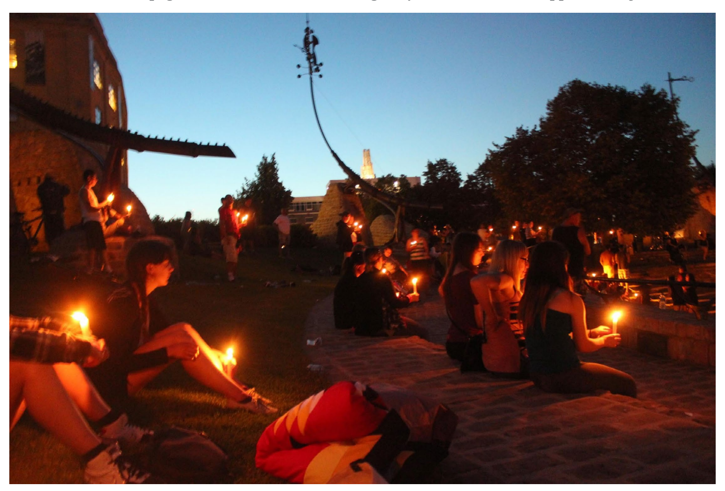
Memorial event for missing and murdered Indigenous women and girls. Winnipeg, July 2015.

colonial violence and disappearance: in both cities, dead Indigenous people have been pulled from their depths. Others are thought to still be in the water. In this sense, they are unsettled graveyards where the disappeared might be