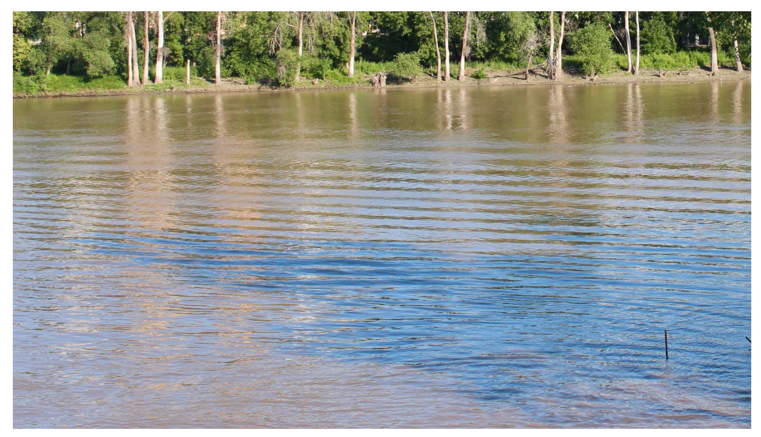
The Red River near The Forks in Winnipeg.

There are days when the boundaries of the present fall away and I see myself in one of these other futures. On a warm summer afternoon, rather than looking for traces of missing women on a patrol, I might instead pass by some of them on these very streets.[15] They would not be watching us from beneath the shimmering surface of the river. No one would need to put up missing person posters or desperately search throughout the city, pouring messages into the ground with their footsteps and into the air with their breath. In this future, their families didn't need to call out or wait. The women were already almost home.