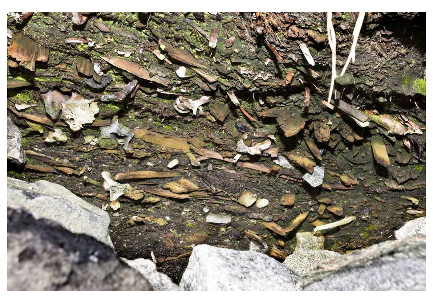
Archaeological middens in Greenland often contain large amounts of very well-preserved organic materials. The midden at Kangeg is no exception; here large amounts of wood and bone have survived for centuries.

The next wave of settlers was the Thule, who eventually became the modern Inuit Greenlanders. Their attention to seasonal rhythms along the coasts and fjords of Greenland is echoed in the remains of Kangeq. There is much to learn from these ancient cultures, especially with the new tools of analysis available to researchers, but the evidence is disappearing faster than it can be gathered.