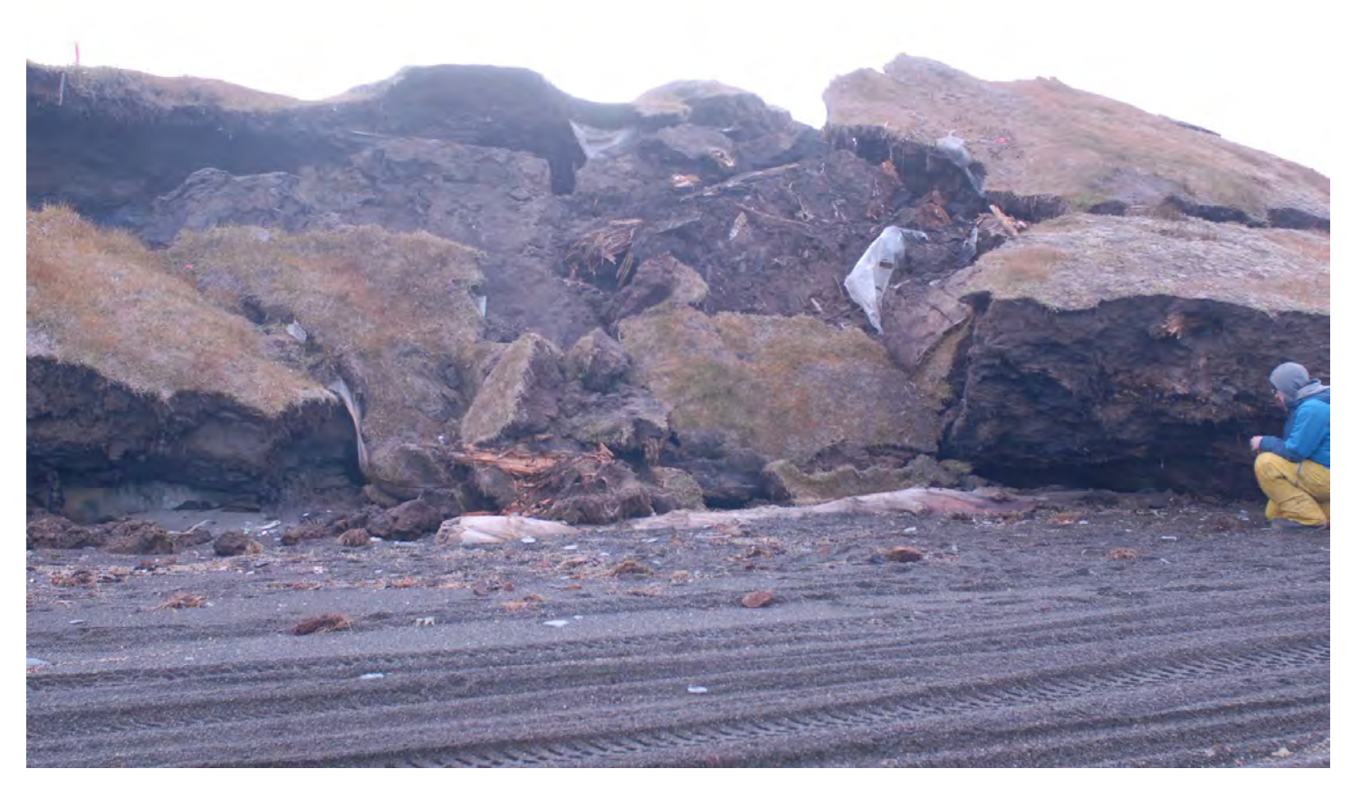
3000 years of cultural deposits all over the beach at Walakpa.

eroding coastal bluffs began exposing human remains and cultural materials several decades ago. This was a village site with a long history that had been relocated more than once due to erosion (Krus et al. 2019). Excavations showed that human occupation there had stretched back not decades but over a thousand years, predating when the Thule, or ancestral Inuit, lived there, making Nuvuk a key site for understanding the Thule migration across the North American Arctic to Greenland over the next several centuries (Jensen 2017; see also, Krus et al. 2019, Tackney and Raff 2019).[2]