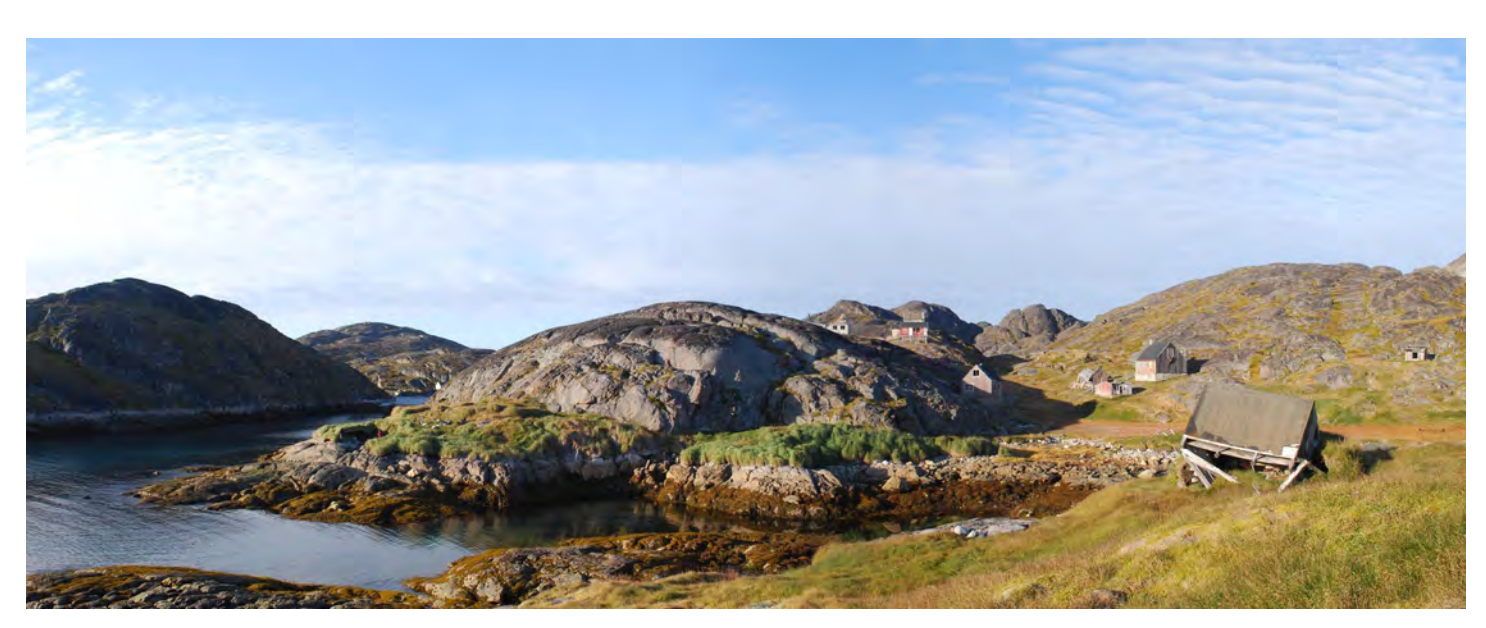
The settlement of Kangeq in Southwest Greenland was abandoned in the 1970s. The site had been occupied for thousands of years.

Boarded-up houses and an abandoned church still remain at Kangeq. A pool of sludge on the water's edge greets researchers coming to assess the site (see Harmsen 2017). Giant whale ribs, wood, glass, and rusting metal stick out of the pool; it is surrounded by a thick layer of compressed turf, which is actually a midden filled with the bones of what the residents of Kangeq were eating over the centuries.