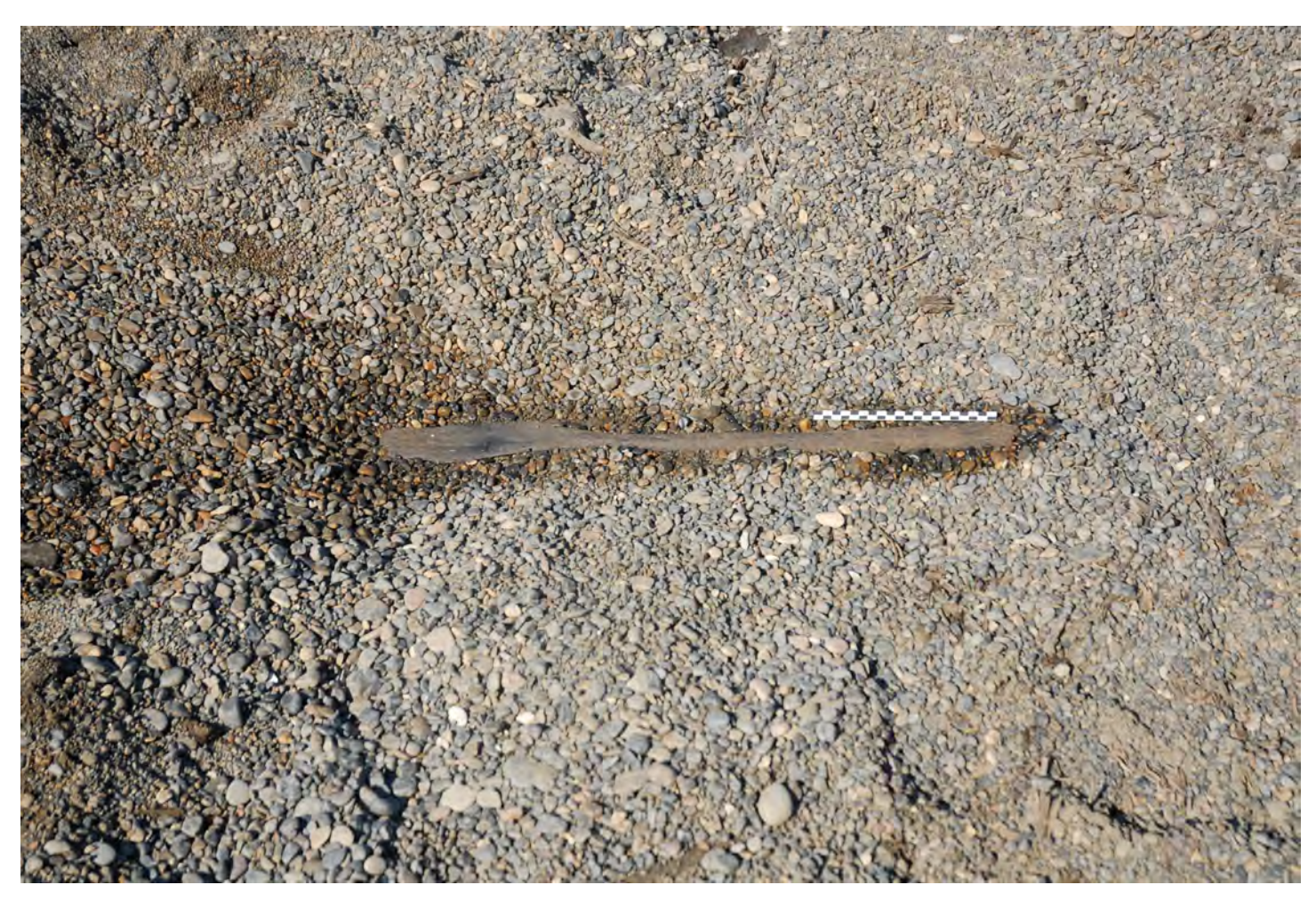
Ipiutak paddle in situ at Nuvuk.

For more on Walkapa and Nuvuk, visit <a href="https://">https://</a> <a href="https://www.youtube.com/watch?v=hh">https://www.youtube.com/watch?v=hh</a> KEQ-ayBI for excavation of a seventeenth-century village in Quinhagak, Alaska, which began eroding away in 2009. Referring to the imminent danger to organic materials normally seen only in museum collections, project director Rick Knecht described the situation as "like museums on fire, libraries."