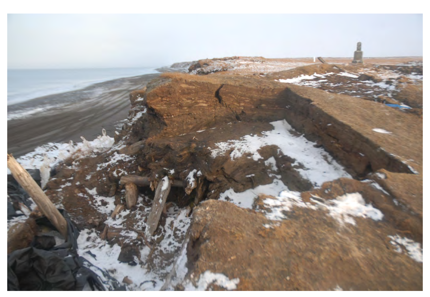
Ancient Walakpa wooden structure slumping into the sea.

What follows is a glimpse of the issues and opportunities currently facing archaeologists who work in the Arctic, using sites in Alaska, Greenland, and Labrador as proxies for the ancient stories in a region that is rapidly thawing and eroding away.