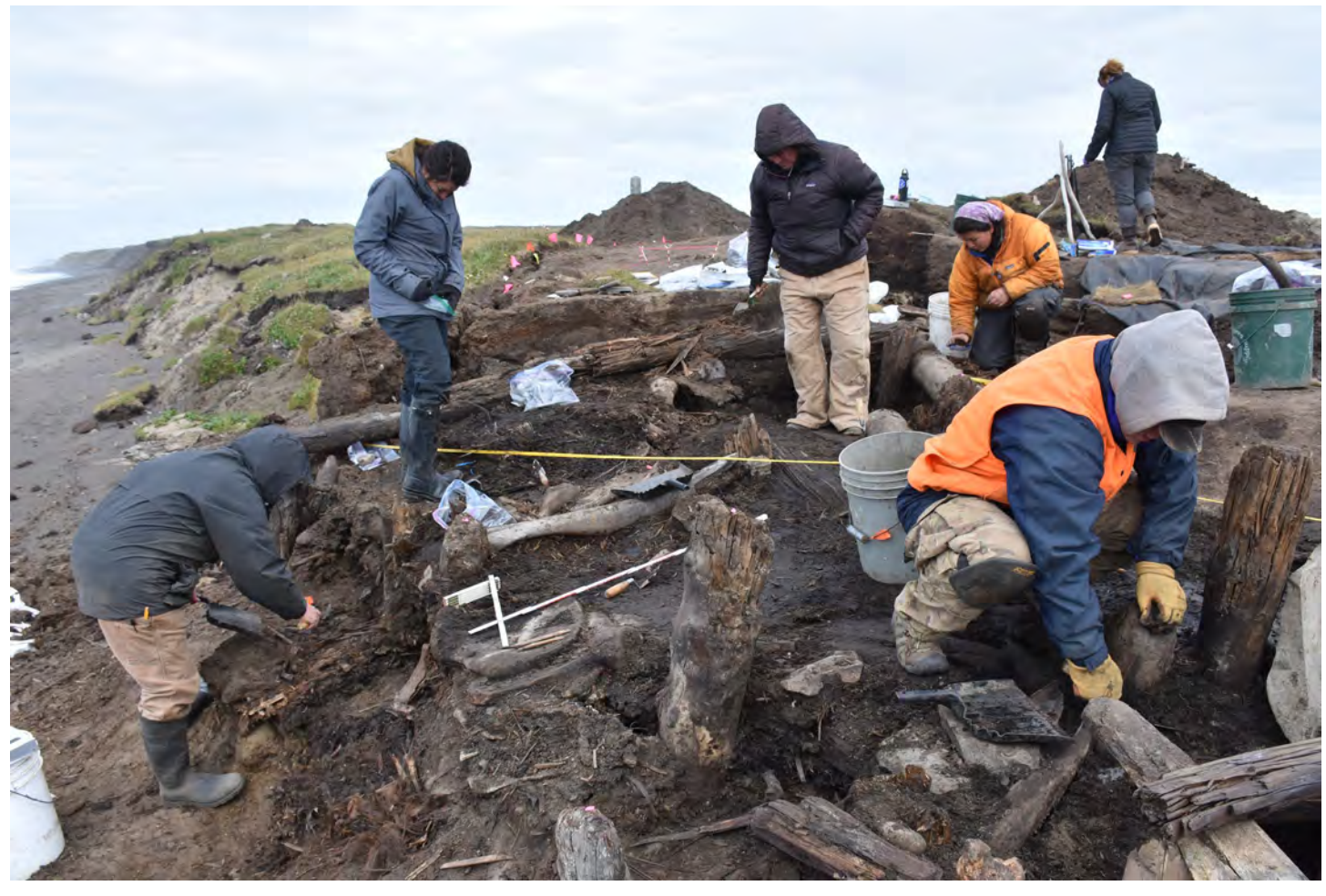
Crew excavating eroding house at Walakpa in 2017.

being destroyed by thawing permafrost, rising sea levels, and increasingly violent storms. Nowhere is this being felt more intensely than in the Arctic, which is warming two to three times as fast as the rest of the planet (Hoag 2019). In addition to increased threats from insects, extreme weather, wildfires, and the release of long-buried pathogens, this rapid warming is destroying the archaeological record (Hollesen et al. 2018). These environmental changes are destroying invaluable and irreplaceable evidence of human history.