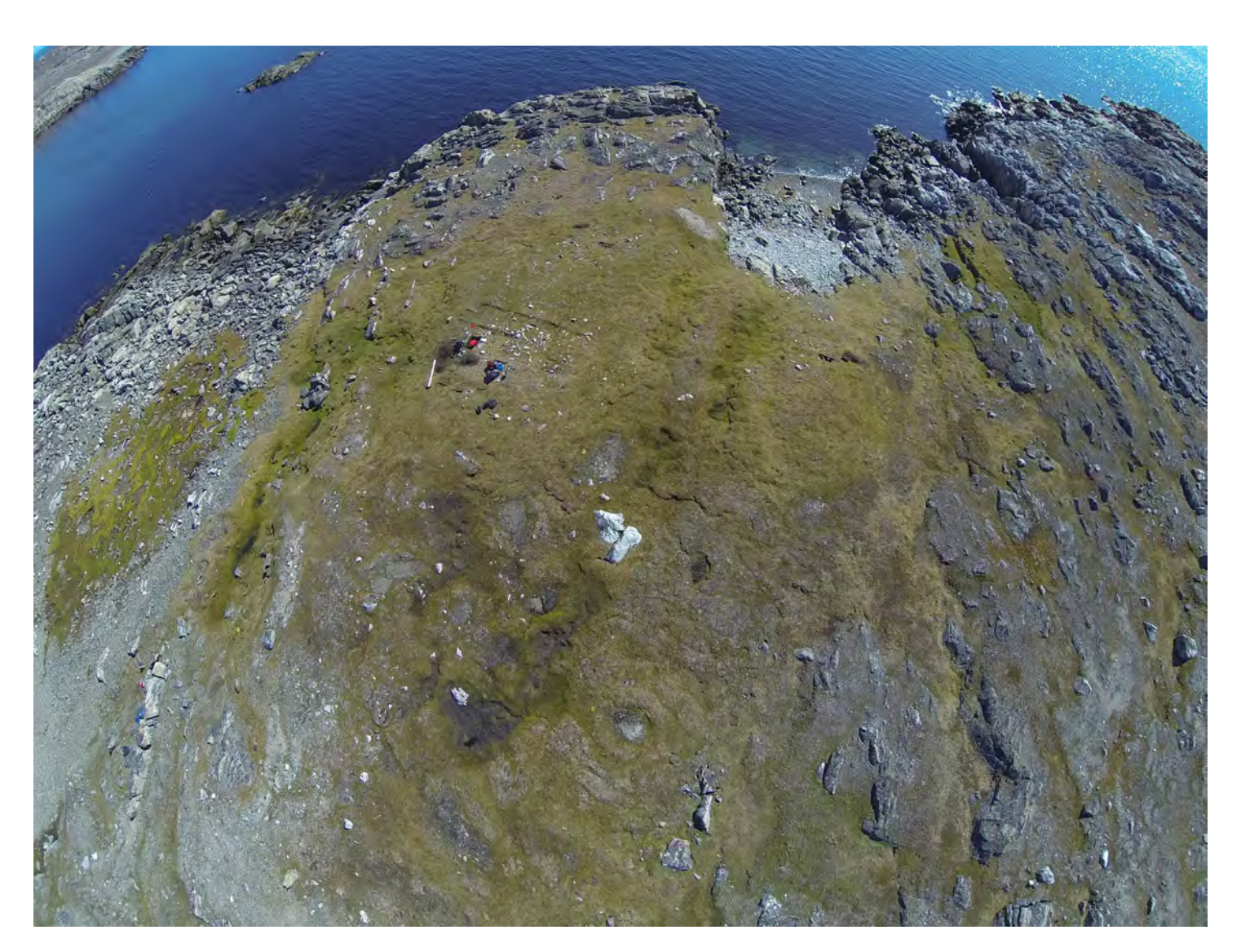
Aerial view of Avayalik-1 taken in 2016 using a drone. The 1978 excavation is visible in the top left quadrant of the photograph. The small cove southwest of the excavation showing active erosion is at the top of the photograph. Dark green areas in the center section of the image are where melting permafrost is pooling.

picture of what life was like some 1,500 years ago, in an ecologically rich area accessible to groups living as far away as Baffin Island and Hudson Bay. Perhaps it was even a central gathering place or an important stop on a vast trade route. Time is running out for researchers to gather the fragile organic materials that hold the clues to this and other stories in the Arctic.