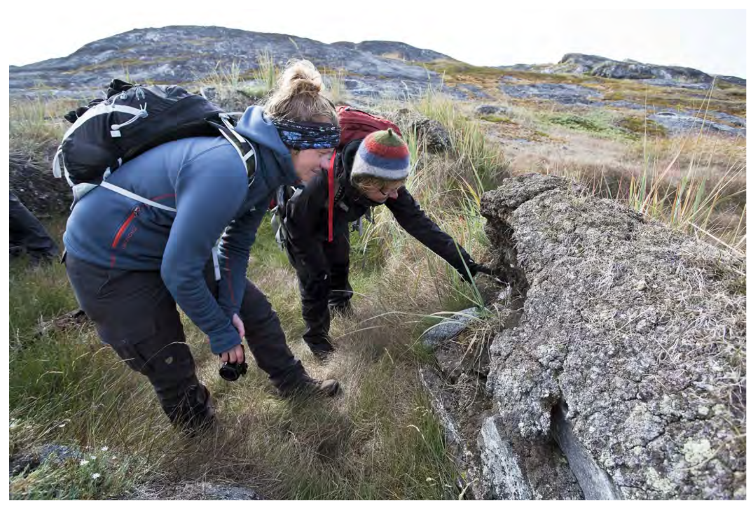
During the REMAINS of Greenland project, scientists have visited 14 different archaeological sites in the Nuuk region. Here the state of preservation is being evaluated at the heavily eroded site of Nuugaarsuk.

Researchers face the task of salvaging what they can of the remains from 4,000 years of human occupation in coastal settlements. Until the late twentieth century, these data have been preserved in middens protected by permafrost; they were veritable time capsules of material culture to be added to the stories passed down through generations: how people lived, what they ate, the tools they used, patterns of trade and migration. Over the last several decades, archaeological