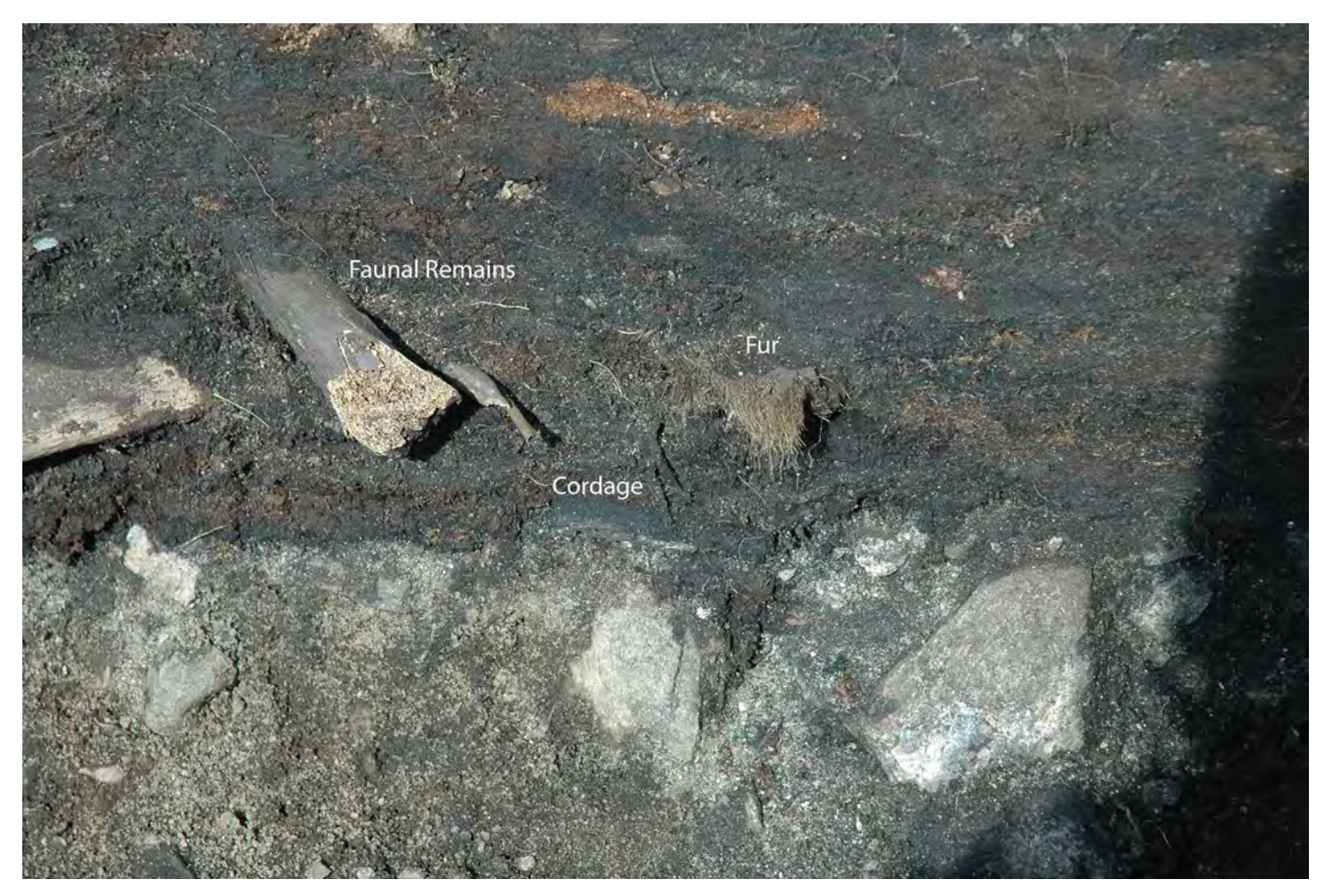
Profile of 2016 excavation unit in Avaylik 1, House 1. Lower portion of the cultural deposit visible in the north wall of 2N/8E shows faunal remains, a piece of cordage, and a piece of fur protruding from the wall. The light-colored deposit at the bottom of the photograph is sterile deposit.

Thus it was the growing concern about the effects of global warming on Avayalik-1 that sent researchers back to Avayalik Island. They carried out limited excavations at the site to collect wood and charcoal samples to establish a chronology, gather soil samples and faunal remains for archaeometric analysis (unknown in 1978), and assess the stability of Avayalik-1 and other sites in the area. They documented areas that were thawing and eroding. "The dried-out deposits on the edges of the terrace are actively