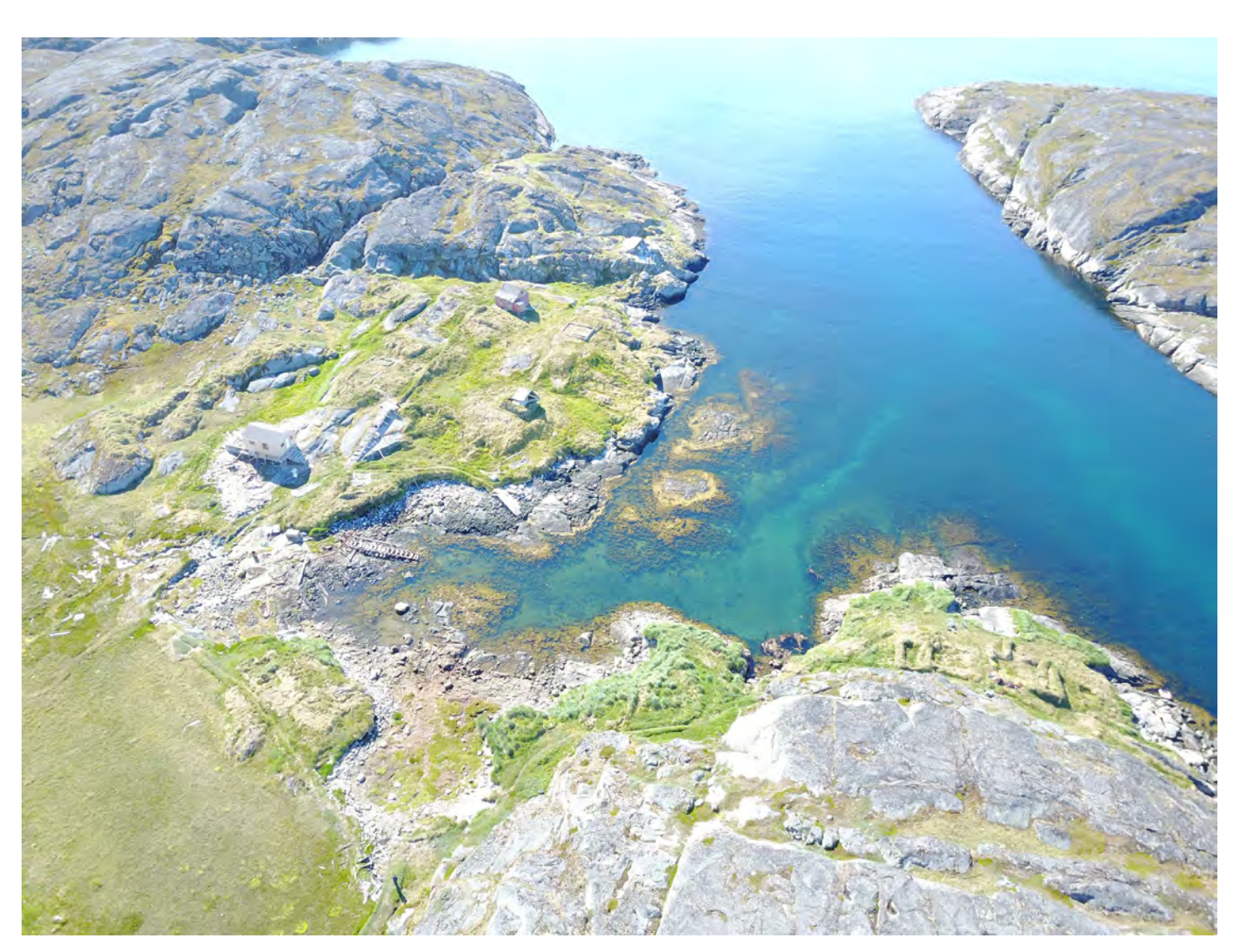
Remains of the village of Kangeq as seen from the air.

example, the Saqqaq peoples, who inhabited the area from approximately 2400 B.C. to 800/500 B.C., were part of a broad techno-cultural tradition (Arctic Small Tool tradition or ASTt) and genetically related to ancient populations that originated in the Western Arctic (Siberia/Alaska). Archaeologically, in addition to the Saqqaq, these ancient groups are represented in Greenland by the Independence I (ca. 2400–1300 B.C.) and Greenlandic Dorset (ca. 800 B.C.–A.D. 1) (Grønnow & Sørensen 2006).