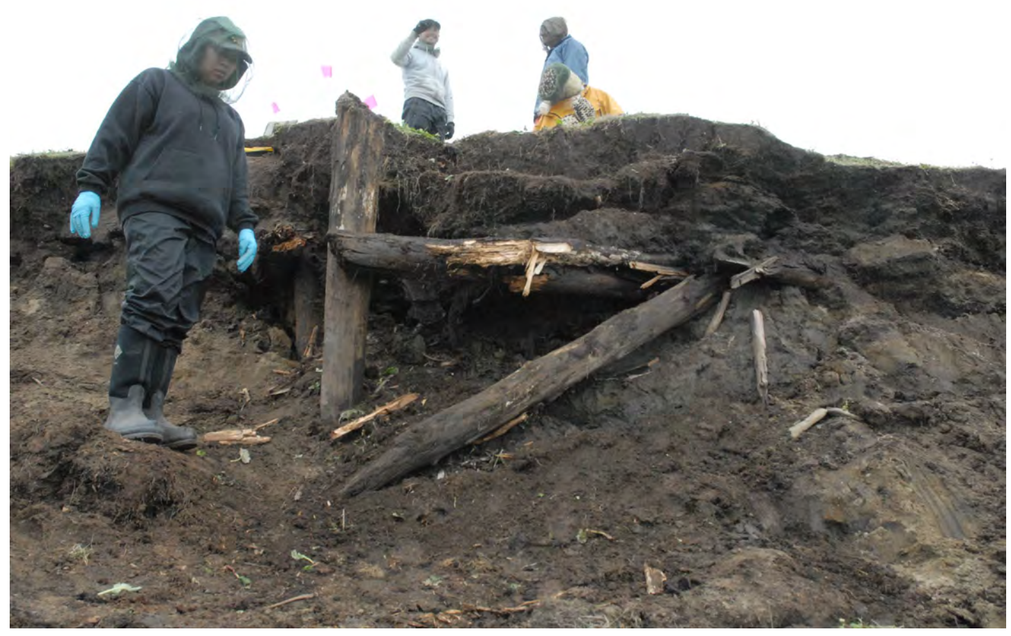
Walakpa house with overhang gone.

Until just a few years ago, this house (above) had stood literally frozen in time. It held not only millenia-old cultural data, but biological data, as well: basic zooarchaeological data, stable isotopes, ancient DNA[1], cortico steroids, and trace