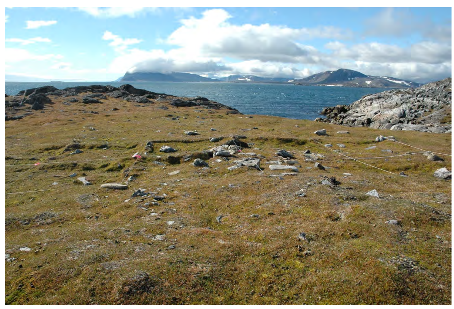
Avayalik-1, House 1 in 2016, view looking south. Backfilled site was well sodded over. Photograph taken after archaeologists re-gridded the area in preparation for opening sample excavation units in the structure.

cultural materials. Under the house were a frozen Middle Dorset house and midden containing organic artifacts and faunal remains, including hundreds of wooden artifacts, strands of musk ox cordage, objects made from baleen or whalebone, and even pieces of worked hide. Analysis of these materials had allowed researchers to begin to develop an understanding of the ecology of the North Atlantic before European whalers removed large numbers of baleen whales resulting in a cascade of changes in the ecosystem. Researchers speculated on trade routes that might have brought non-native materials to the region. They