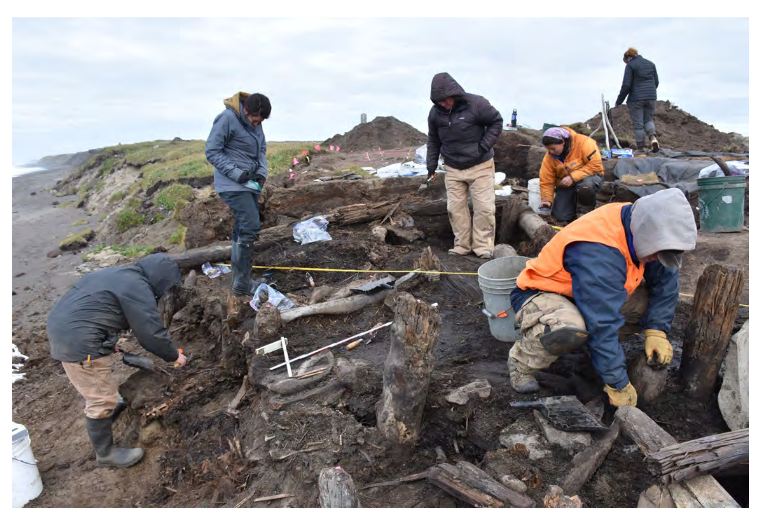
Crew excavating eroding house at Walakpa in 2017.

After a fall 2014 storm uncovered Walakpa, international volunteer efforts to salvage data from the site began in 2015, with support from the landowner (an Alaska Native village corporation) and many individuals (Jensen 2018). Another storm in 2017 nearly destroyed the site, exposing human remains and more cultural and biological materials. The urgency of the situation and the need to move quickly to begin recovery (including the appropriate handling of human remains) outpaced traditional funding cycles for such a project—exemplifying one of the many challenges facing researchers in the Arctic zone.