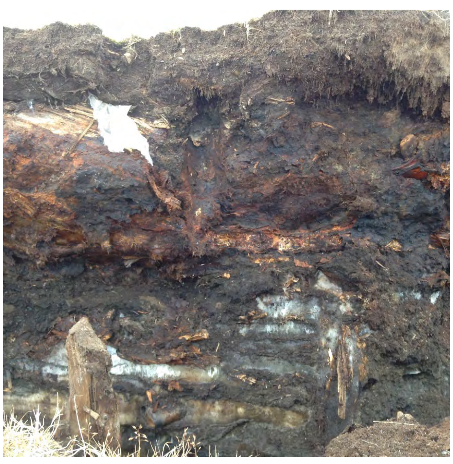
Walakpa slump block strata showing remains of a storage pit or ice cellar (reddish layer) and possible earlier abandoned ice cellar below (ice lenses separated by soil). A baleen (whalebone) bucket is visible in the lowest ice lens, just to the right of the post.