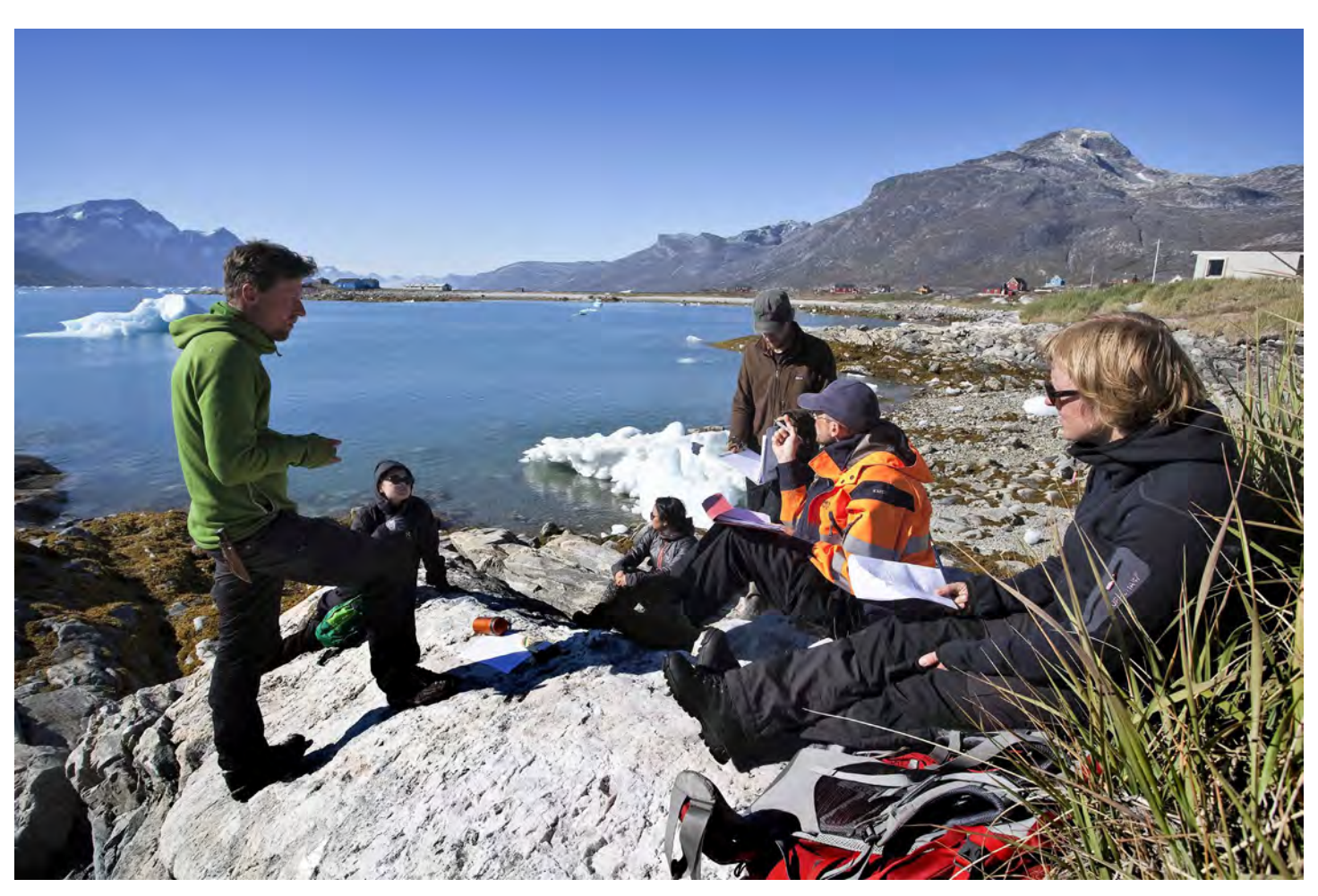
Researchers from REMAINS team are discussing how to evaluate the archaeological state of preservation, the preservation conditions, and asset value of organic deposits. The work of the project has led to the development of a standardized field protocol for site description and risk assessment.

One study is assessing current preservation conditions and processes in a kitchen midden in