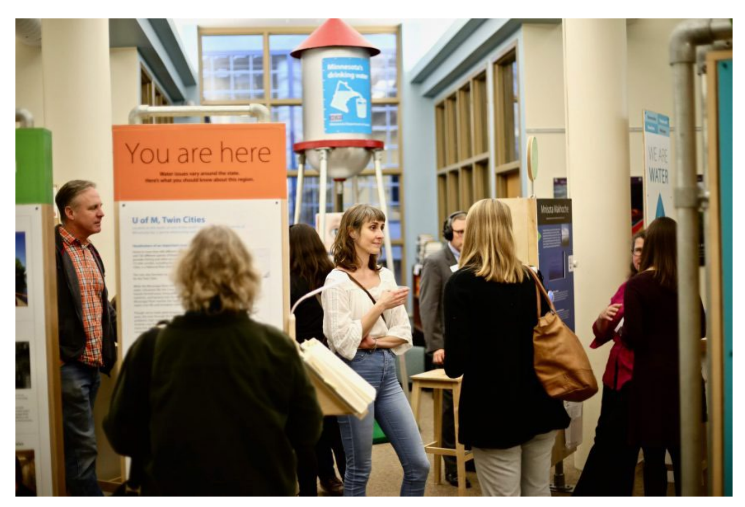
We Are Water MN exhibits are shown here in the Institute on the Environment space at the University of Minnesota.

and spark my drive for collaborations within and outside the University community in respect to absent narratives. With further context to the email, I learned that River Life would be hosting the We Are Water MN exhibit and was looking for the right venue to support the over