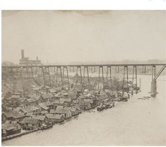
ohemian Flats circa 1910

During the late nineteenth and early twentieth centuries, urban riverfronts were used for industry, not for houses. Few people lived on the river. There were some exceptions though. On what is today the West Bank of the University of Minnesota, on the banks of the Mississippi River, was a multi-ethnic settlement known as Bohemian Flats.