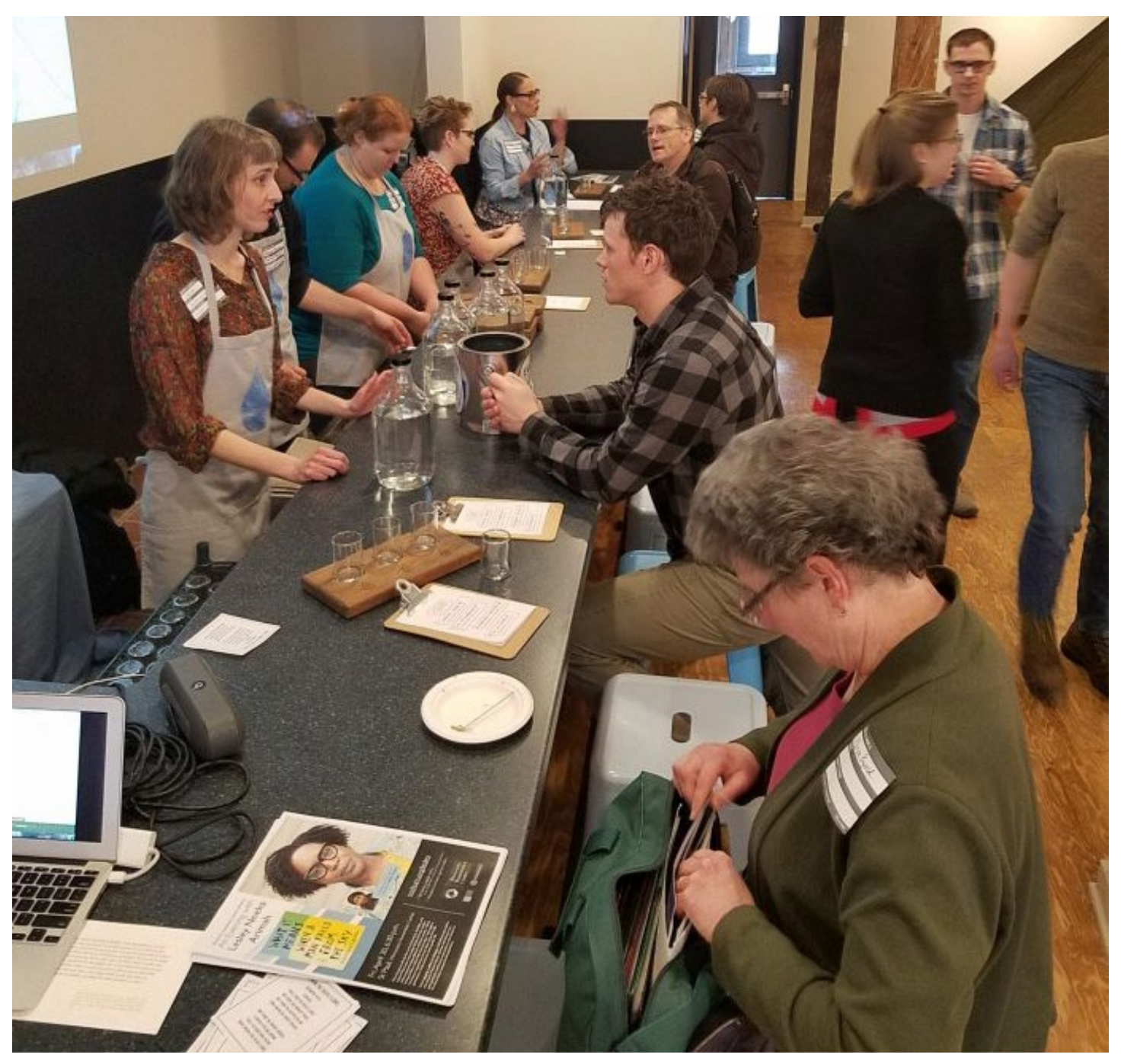
WRS students tend Water Bar.

of students. I never imagined that this negative experience would lead to such growth. It happened on an evening in the fall of 2017 when the Water Resources Science (WRS) graduate students offered to volunteer as "water