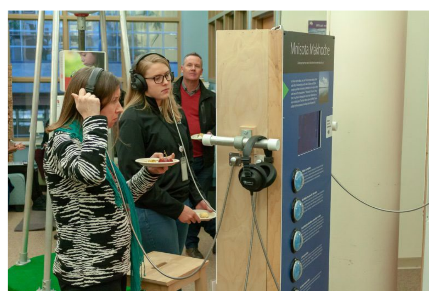
Visitors to the exhibit at the IonE listen to narratives.

and the Minnesota Departments of Health, Natural Resources, and Agriculture taking center stage to reflect on and share their water stories from within and outside the state of Minnesota. We soon all realized most of these speakers also have University of Minnesota connections, which continued to strengthen our connection to place with each other. The University host representatives included the provost of the University and the IonE director who welcomed We Are Water MN to the academic setting and recognized the University's commitment to research and improvements to safe drinking water for all Minnesotans. Aside from the overall feeling of success throughout opening night, the joy and excitement on the faces of our two organizers for the statewide project as they cut the ribbon was so memorable and contagious. It would be hard