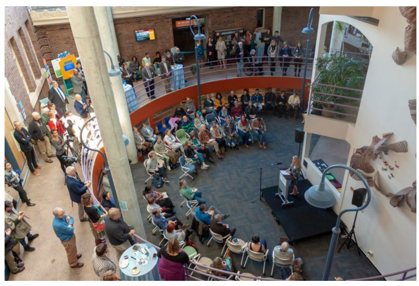
The opening ceremony for the We Are Water MN exhibit at UMN Twin Cities featured speakers in the atrium adjacent to the exhibit itself.

contagious flutter of excitement that you couldn't help but feed into. We even had the opportunity to take a river tour of the Mississippi with each other that day; there is nothing like actually feeling relaxed for an hour before your big event is supposed to start! For someone in the event industry, this is kind of unheard of, but I think meeting representatives of the other seven host sites allowed this relaxing environment to happen. Meeting everyone was an opportunity to hear about how they were going to engage with We Are Water MN and their communities. The host cities were in every corner of the state, which allowed everyone's narratives to emerge, and we were able to collectively learn from each other. Seeing the committed work of the host sites began to showcase this work as an ongoing entity,