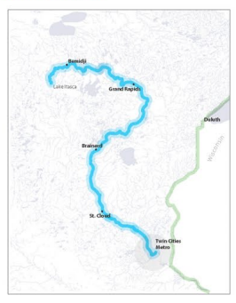
Located on the banks of one of the world's great rivers, the University of Minnesota, Twin Cities, has a special relationship with the Mississinni River

Though we've made great progress over the last thirty years, the river through the Twin Cities continues to have problems: high nutrient levels result in algal blooms, invasive carp threaten to outcompete other species, and many fish show elevated levels of mercury and other contaminant.