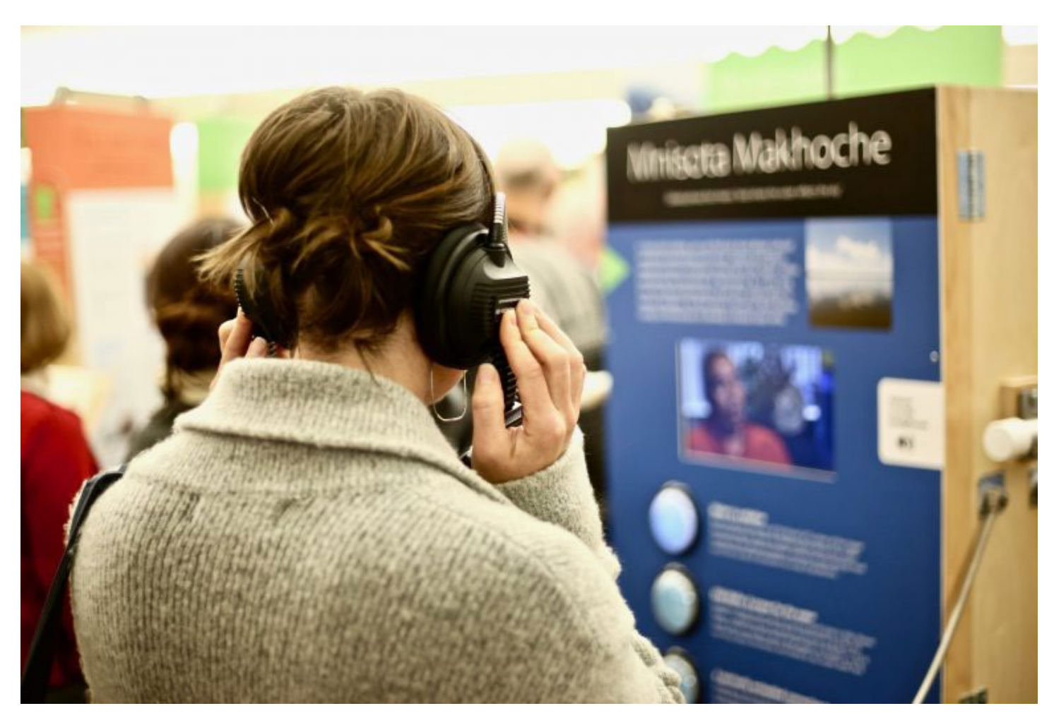
A visitor to the exhibit listens to narratives that explore, in part, the people who have lived here the longest.

Difficult questions notwithstanding, we felt that it was important for River Life to play a host/convener role for We Are Water MN on campus. Planning the installation and management of the exhibit and the accompanying programming allowed us to expand our reach of community partners. For example, although we had worked with the Minnesota Humanities Center before, we had not done any work with the staff from the Minnesota Pollution Control Agency, the Department of Agriculture, or the Department