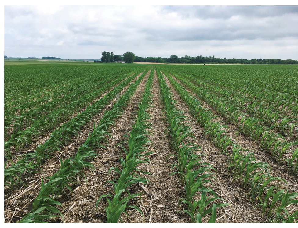
Corn planted in the Little's no-till field with last year's residue holding the soil and suppressing weeds.

With the help of funding from the Rice County SWCD, Tim tried cover crops for the first time