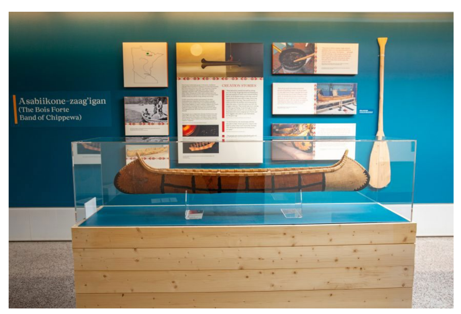
From the exhibit, a birchbark canoe, paddle, and creation stories from the Asabiikone-zaa'igan (The Bois Forte Band of Chippewa).

tural Resources.[1] Consequently, the current exhibit, Why Canoes? Capacious Vessels and Indigenous Futures of Minnesota's Peoples and Places , at the Northrop Gallery should find an