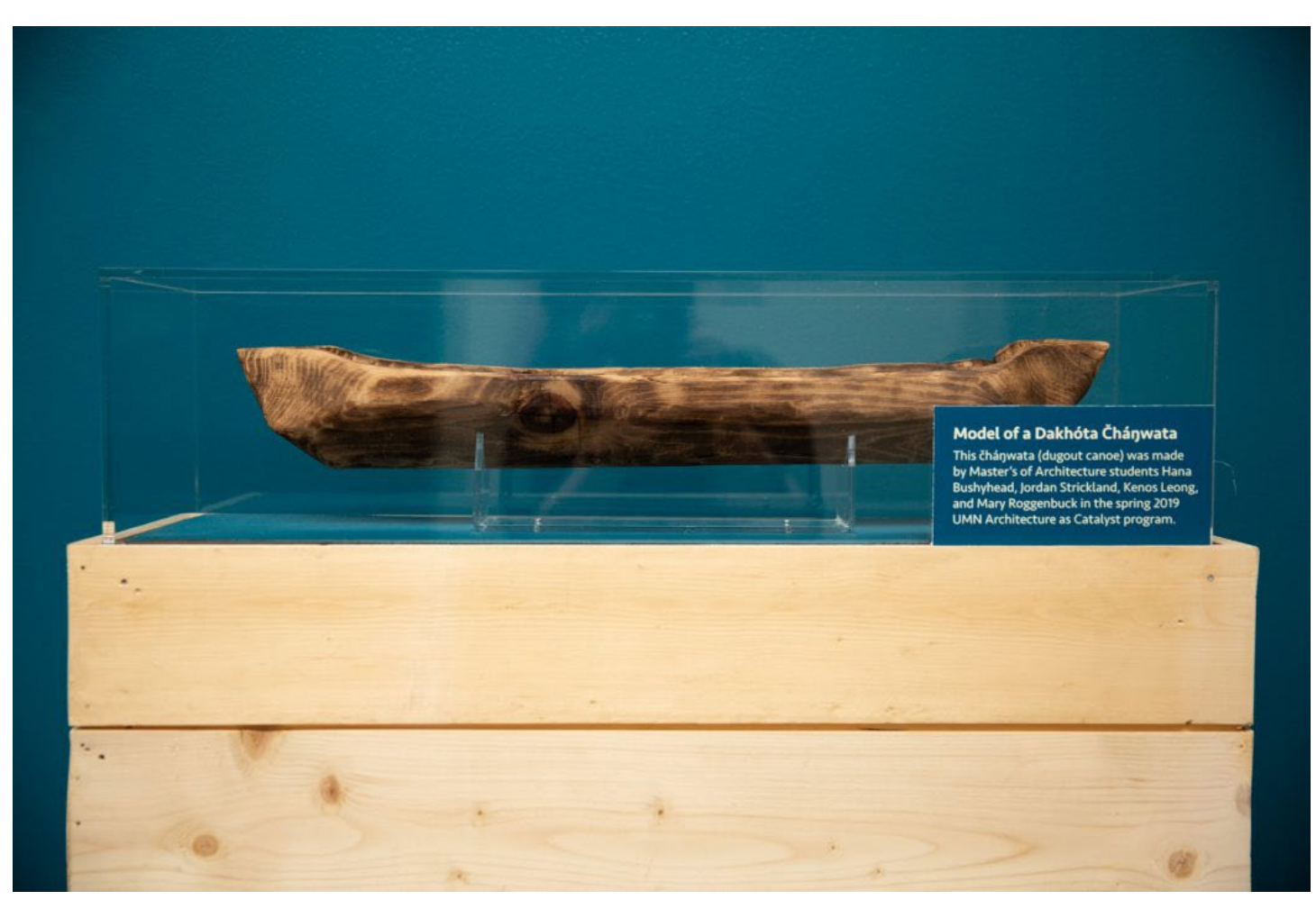
A model of a Dakota chanwata, a wooden dugout canoe.

Why Canoes? is a fascinating exhibit exploring the background and meaning of what for Minnesota has become an icon—the image of the canoe important enough to the state's identity to appear on our license plates since 1978. Why Canoes? beautifully offers insights—through the lens of Indigenous peoples' experience—into the centuries-old story and present-day significance of small boats here in the Land of 10,000 Lakes. A video preview of the exhibit can be seen online