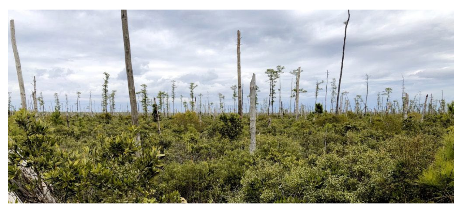
Ghost forest panorama in coastal North Carolina.

climate change is altering landscapes along the Atlantic coast. It's emblematic of environmental changes that also threaten wildlife, ecosystems, and local farms and forestry businesses. Like all living organisms, trees die. But what is happening here is not normal. Large patches of trees are dying simultaneously, and saplings aren't growing to take their place. And it's not just a local issue: Seawater is raising salt levels in coastal woodlands along the entire Atlantic Coastal Plain, from Maine to Florida. Huge swaths of contiguous forest are dying. They're now known in the scientific community as "ghost forests."