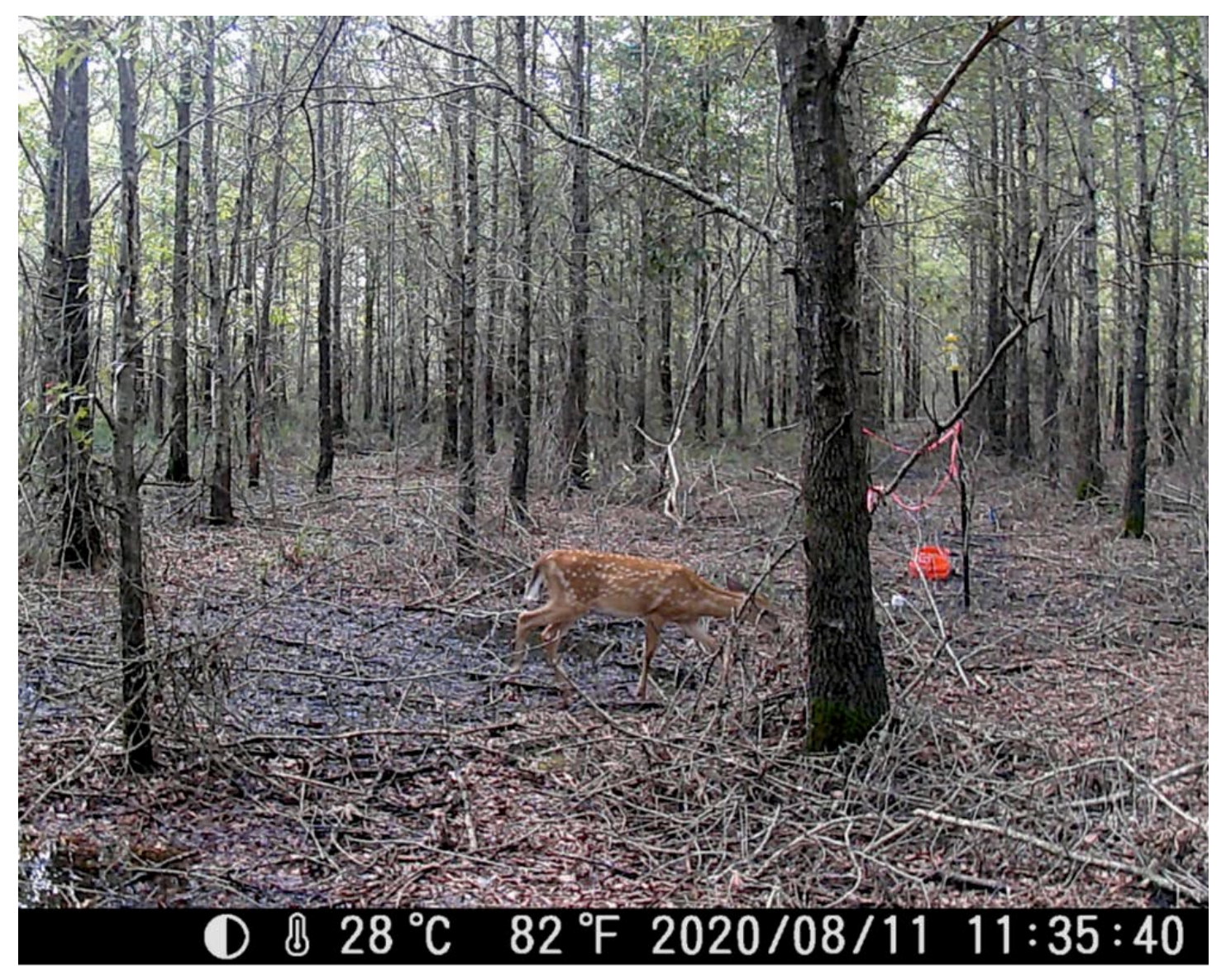
Deer photographed by a remote camera in a climate change-altered forest in North Carolina.

After two years of effort, the salt didn't seem to be affecting the plants or soil processes that we were monitoring. I realized that instead of waiting around for our experimental salt to slowly kill these trees, the question I needed to answer was how many trees had already died, and how