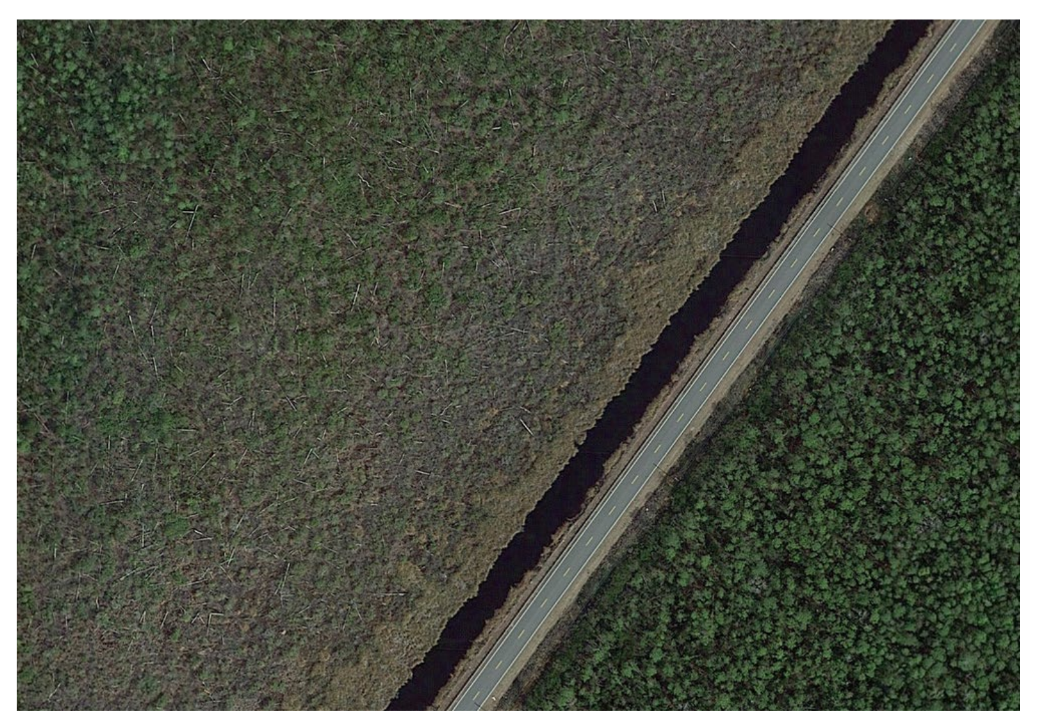
Google Earth image of a healthy forest on the right and a ghost forest with many dead trees on the left.

We found that the largest annual loss of forest cover within our study area occurred in 2012, following a period of extreme drought, forest fires and storm surges from <u>Hurricane Irene</u> in August 2011. This triple whammy seemed to have been a tipping point that caused mass tree die-offs across the region.