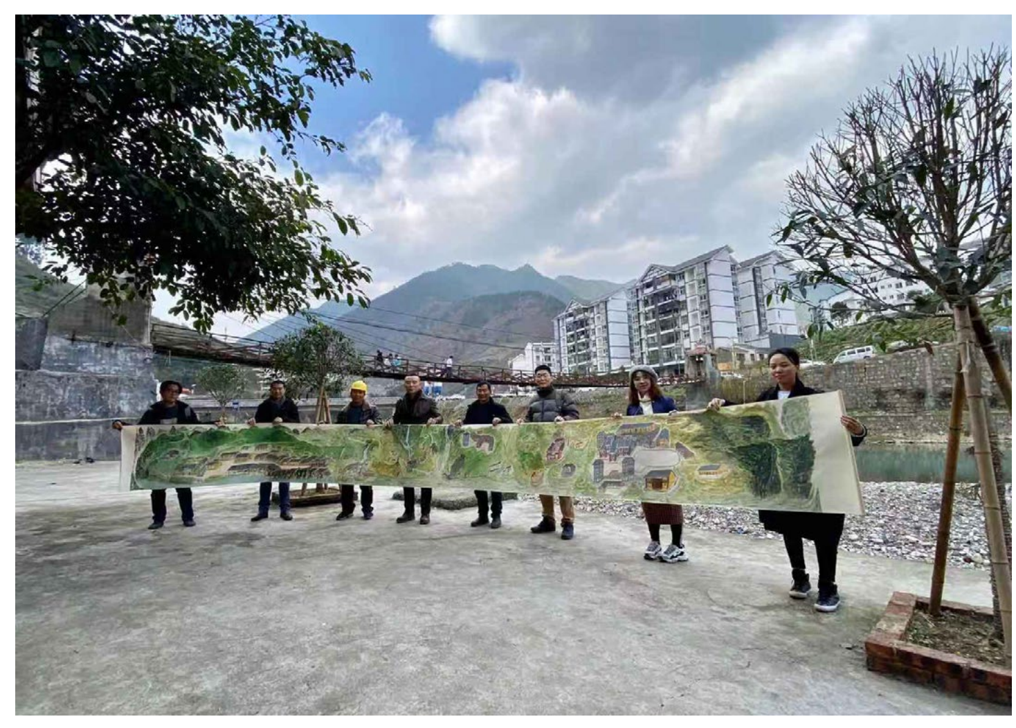
Xie Xiaochun's work. A picture of Yangdeng River. Image by Xie Xiaochun. Image courtesy of Jiao Xingtao.

people and materials in Yangdeng. The materials for the rural community and the mountain goods of Yangdeng are all transported by boats. In the 1970s and 1980s, rivers were dredged every year. In many river sections with rapids, people on the boat needed to disembark when going downriver. Only one person was left at the helm, and the others were pressed against the hull on the side of the riverbank to avoid being pushed against the rocks. Ten people pulled the rope at the stern to let the boat descend and move slowly, until reaching a place where the current was stable. When going upriver, one person would get off into the