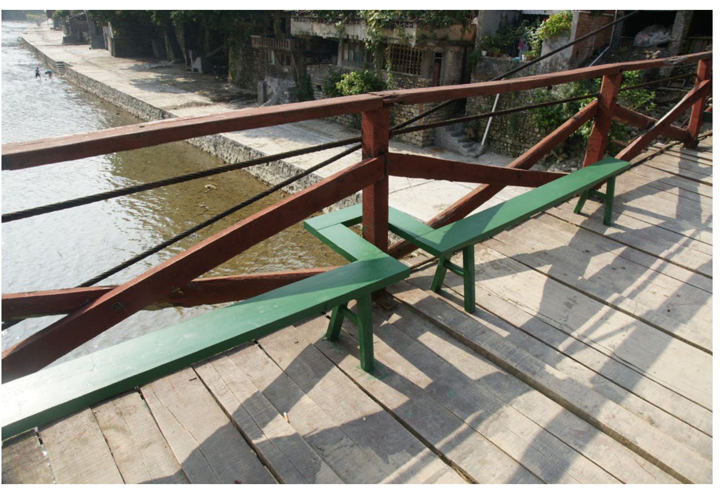
几-shaped bench on the suspension bridge by the Yangdeng Art Cooperative.

funded by the government, the other suspension [JX] There are three bridges in Yangdeng town: bridge was built 20 years ago with private donations made by the residents of the town. two cement bridges—one is at the east end of the town, one is at the west end of the town—and the The suspension bridge is made up of multiple other is a wooden suspension bridge in the midsteel cables connecting the two banks and laying dle of the town. The cement bridge at the east end wooden boards on them. It has experienced many of the town was built in the 1970s. It was the only summer floods and has been destroyed several road bridge connecting the two sides of the river times, and each time it has been repaired through at that time. The cement bridge at the west end private fundraising.