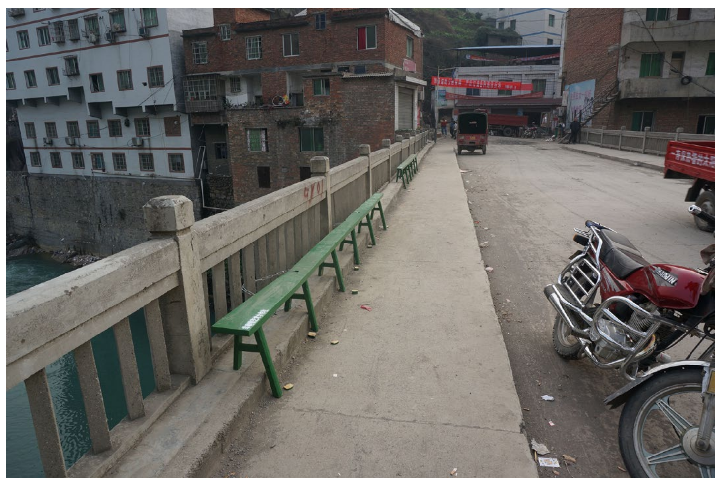
Use a whole piece of wood as a stool, and according to the height difference of the site, cut off one side of the stool leg, so that it can be laid flat.

the upper, middle, and lower reaches of the river. They believe that the hospitable and outspoken personality of local people was formed from the historic prevalence of visitors who arrived because they were aided by boat docks in the past on the river, and today, they are proud of this shared characteristic of warmly welcoming visitors.