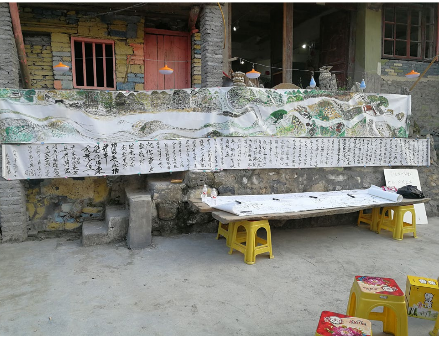
A picture of Yangdeng River exhibited by the riverside.