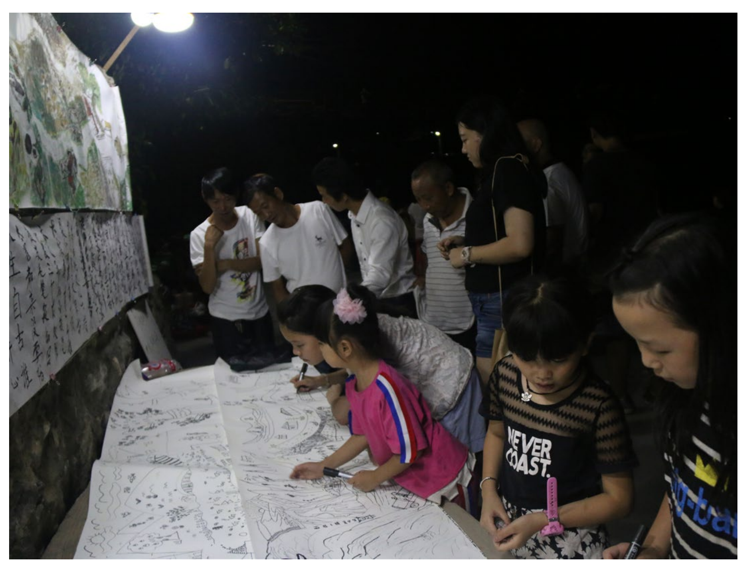
Residents collectively created a picture of Yangdeng River 2, once again.

First, to explain a term: Shigandang are collectively the traditional heritage of worshiping spiritual stones now commonly practiced in Tai'an, Shandong province, and elsewhere. The Shigandang custom of worshiping spiritual stones has long been a common belief for Chinese people. According to legend, Shigandang was a brave and strong man from Mount Tai who was renowned for warding off evil spirits. His spirit lives on today through an ornamental stone tablet engraved with the Chinese characters of Shigandang, which is often found erected at certain points on bridges and roads across China.