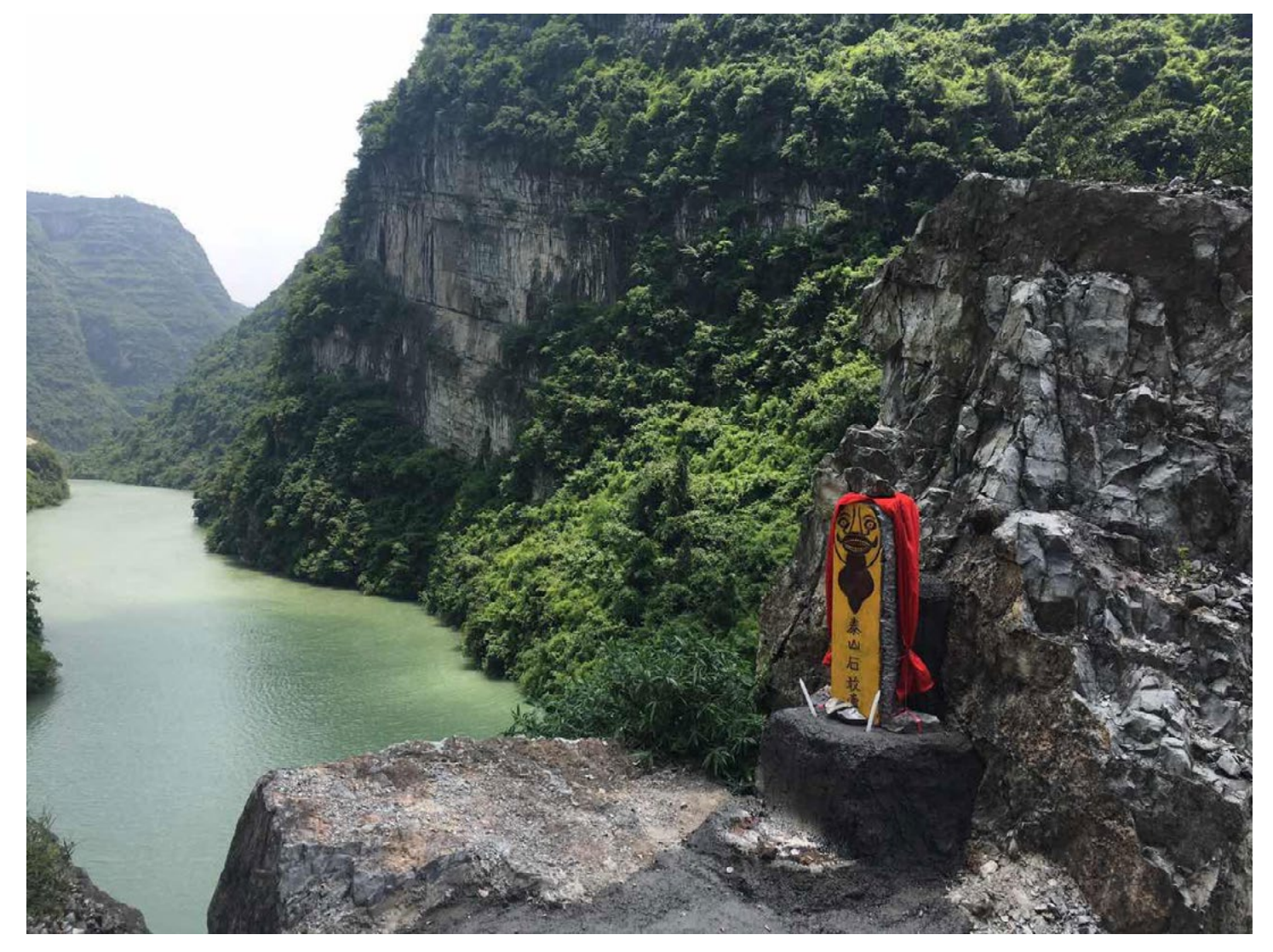
The Twelve Jing Xiakou, a real scene, Taishan Shigandang.

Cooperative Project 2012–2017. [1] It is bilingual, provides rich textual, critical, and aesthetic documentation of the community and various art projects undertaken over six years.