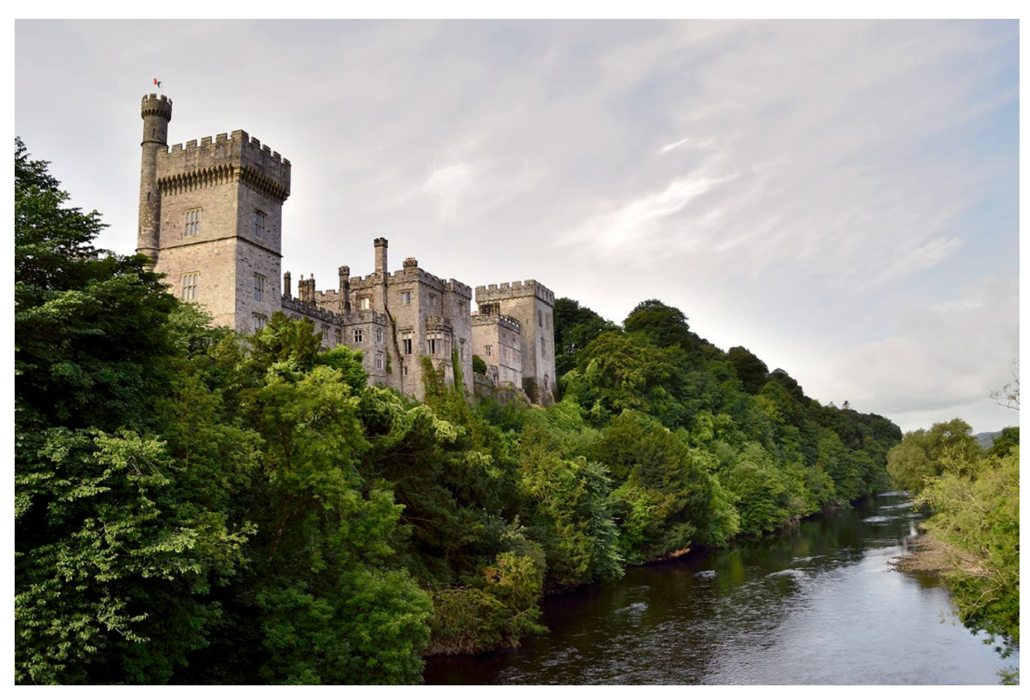
Lismore Castle from the Blackwater.

Almost one hundred years later, in the Great Basin Desert of northwestern Utah, Nancy Holt's (1938–2014) Sun Tunnels (1973–76) continued