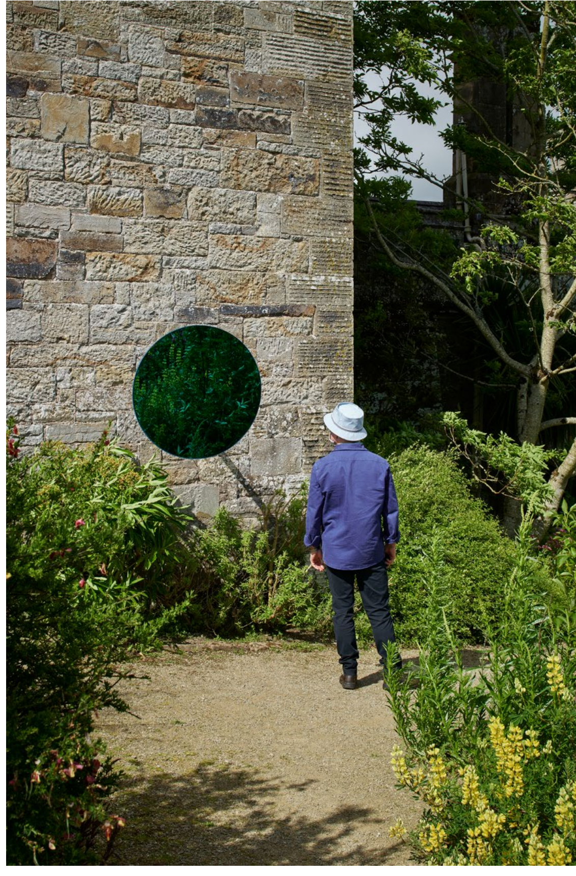
Charlotte Moth 'Blue reflecting the greens' (2021) at Lismore Castle Arts.