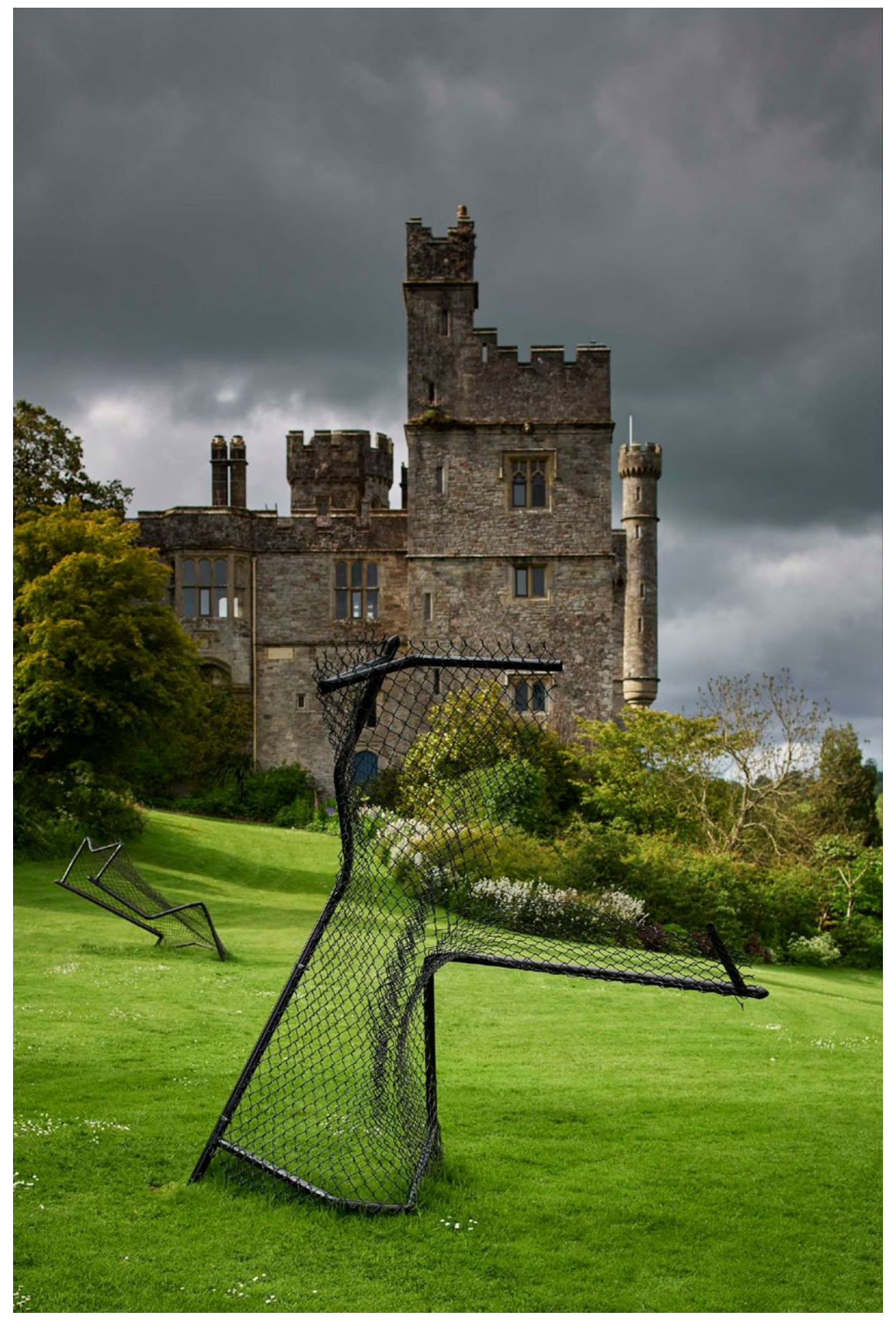
A. K. Burns 'The Dispossessed' (2021) at Lismore Castle Arts.