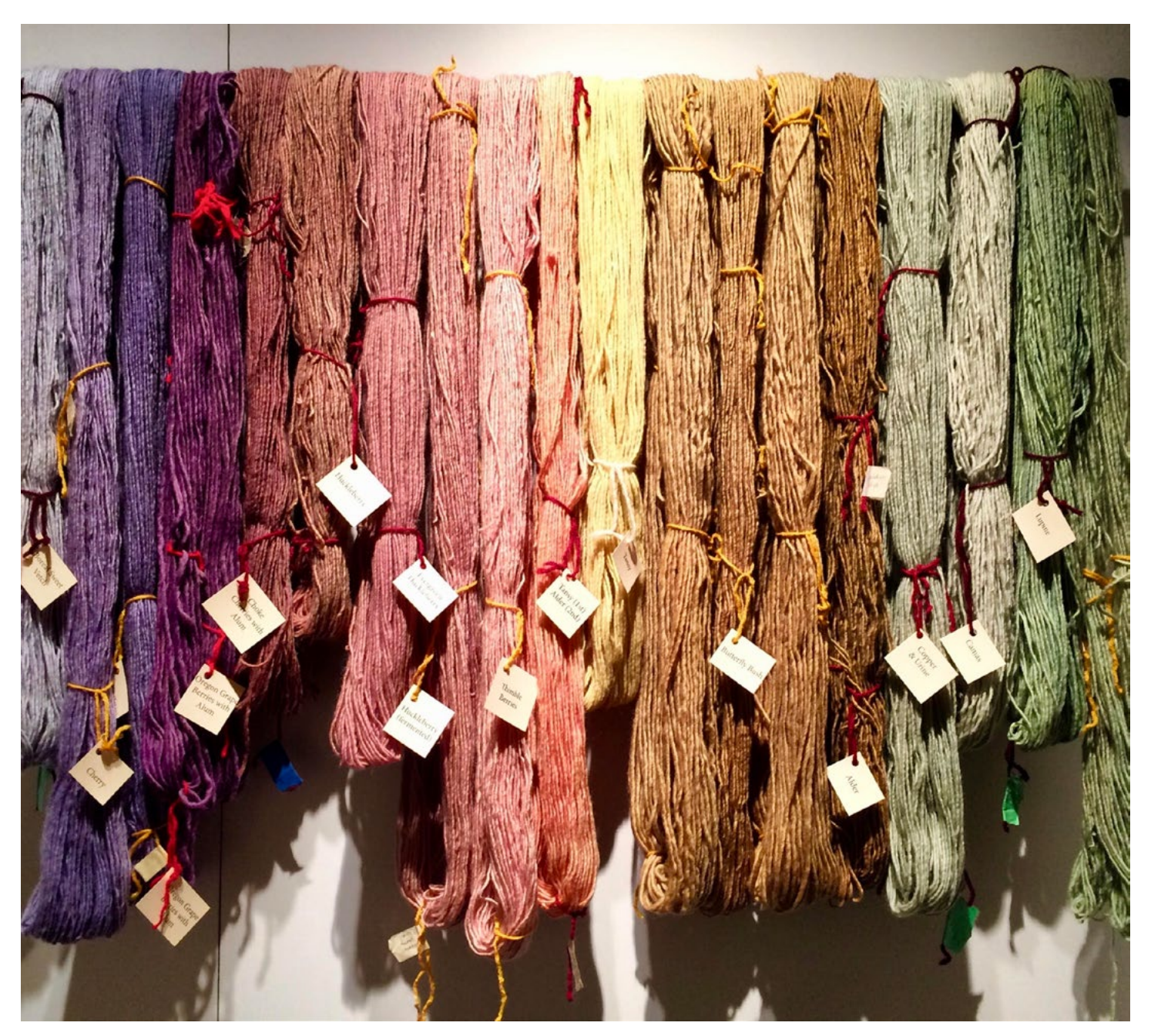
Figure 5. A collection of naturally dyed sheep yarn displaying a rainbow of colors created from berries, lichen, minerals, and wildflowers.

dog fur while spinning the yarn (Hammond-Kaarremaa 2018). In the early twentieth century, a Snuneymuxw man described the exchange of bales of Salish wooly dog fur and mountain goat wool between local Indigenous communities. He witnessed women "taking a little wool away or adding some to a bale until both were happy that it was a fair exchange," revealing