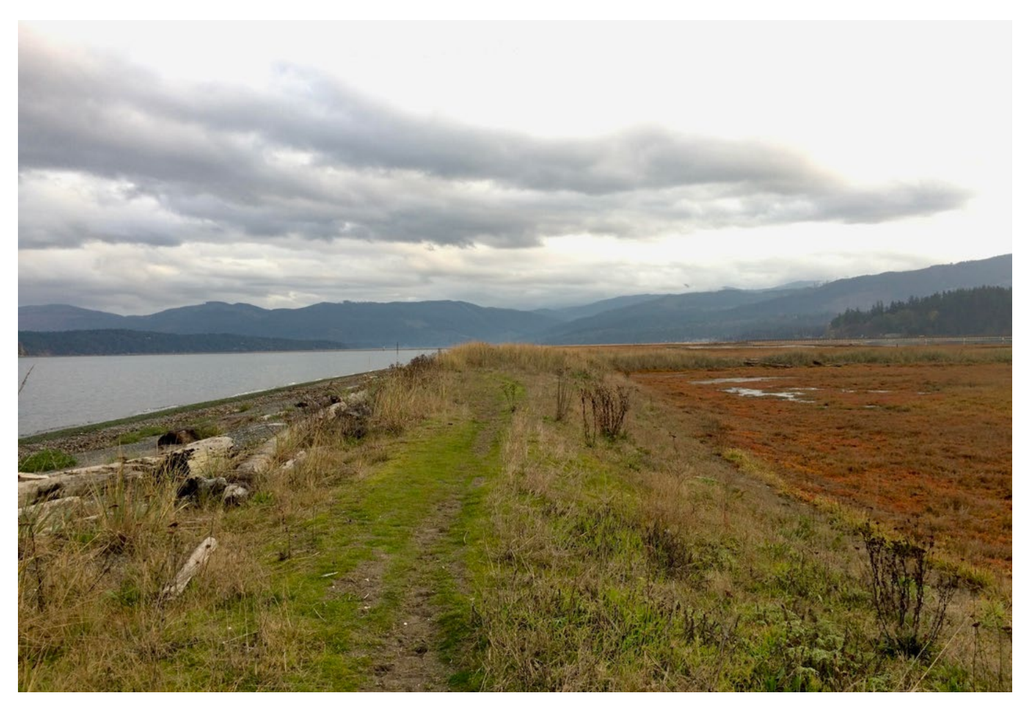
Figure 7. Washington Harbor where the S'Klallam village of Sx<sup>w</sup>čk<sup>w</sup>íyəŋ was once located. Housing 10 longhouses, the village was forced to disband in the 1880s when a clam cannery was founded at the same site. S'Klallam men and women worked for the cannery until the 1960s when it closed.

Some hop farmers and investors chose former camas prairies for their hop fields (Raibmon 2006). Prairies did not contain large cedar trees that needed to be cleared; they were often level plots of land, and prairie soil was naturally high quality and well drained. When women relocated