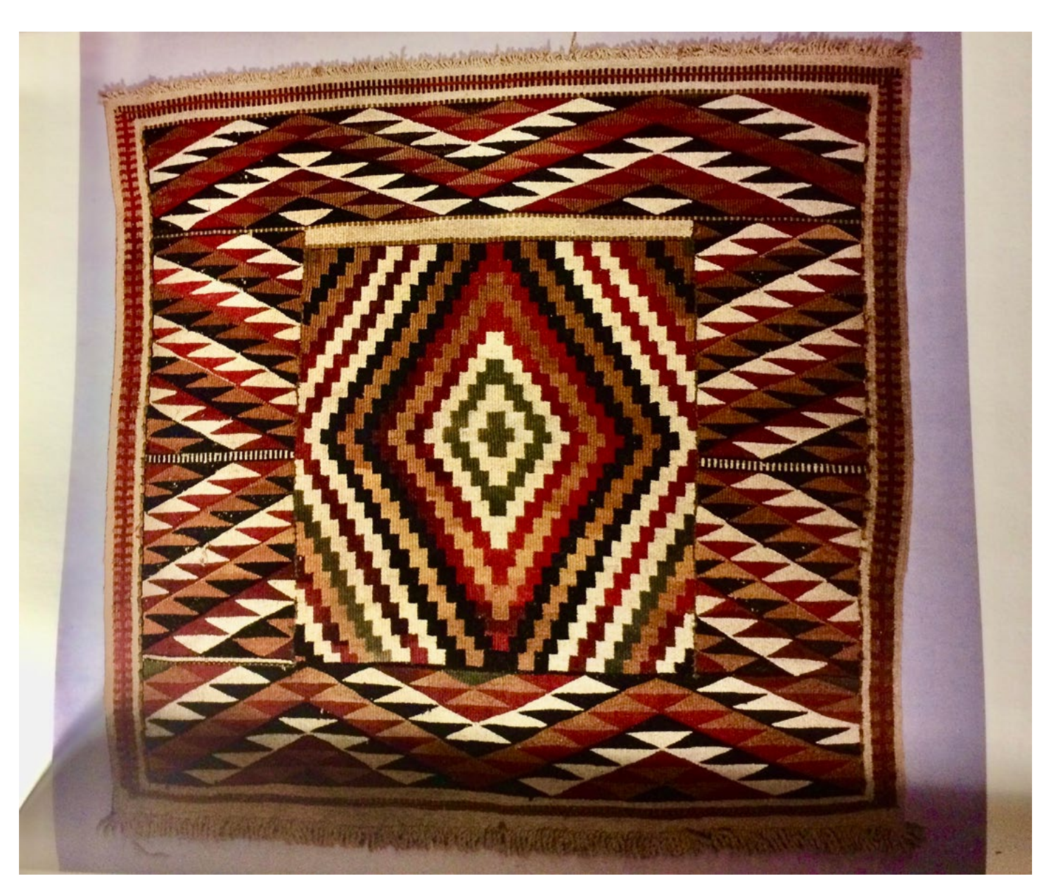
Figure 3. A Coast Salish weaving (circa pre-1841) created from spun and dyed Salish wooly dog fur.

participation in dog-keeping was reflective of the economic, cultural, and political influence that women held in Coast Salish society. Myron Eells, a Congregationalist missionary who lived on various Coast Salish reservations throughout the 1800s, noted that a Coast Salish woman's wealth depended upon how many Salish wooly dogs she owned (Castile 1985). Weavers were considered women of high status, despite that Europeans viewed the art form as a lowly craft that was not considered "high art" (Ariss 2019).