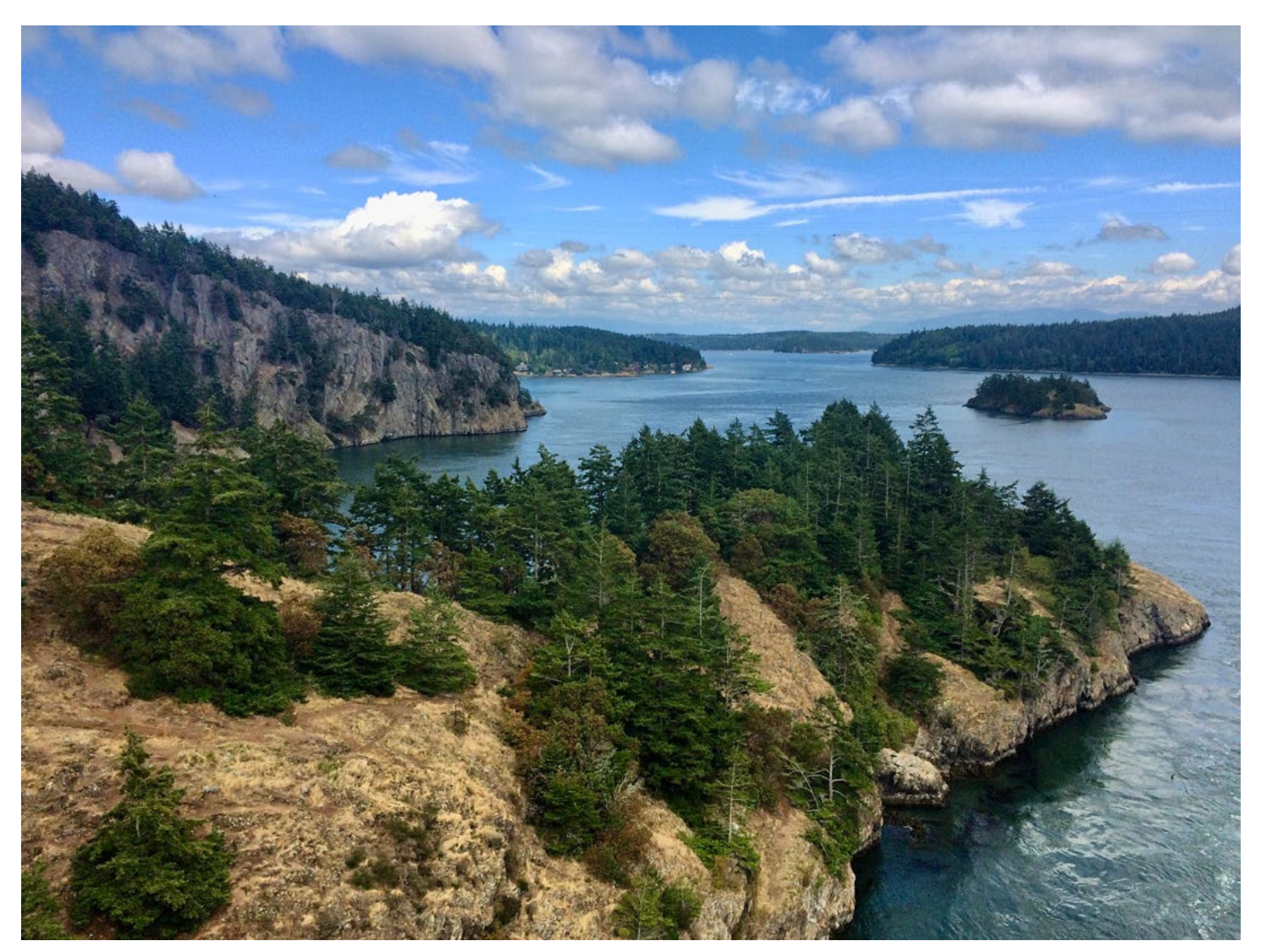
Figure 2. Deception Pass, a waterway that connects the Strait of Juan de Fuca to Skagit Bay in northwestern Washington, has been navigated by Coast Salish women in canoes for millennia.

Resembling a white, downy Pomeranian, Salish wooly dogs were bred by Coast Salish women primarily for their fur, although the small canines were also trained as seeing-eye dogs, guard dogs, and were even credited with taking care of young children when their parents were away. Yet, by 1866, Salish wooly dogs were rendered extinct with the introduction of sheep's wool and European-style attire (Figure 4) (Stopp 2012).