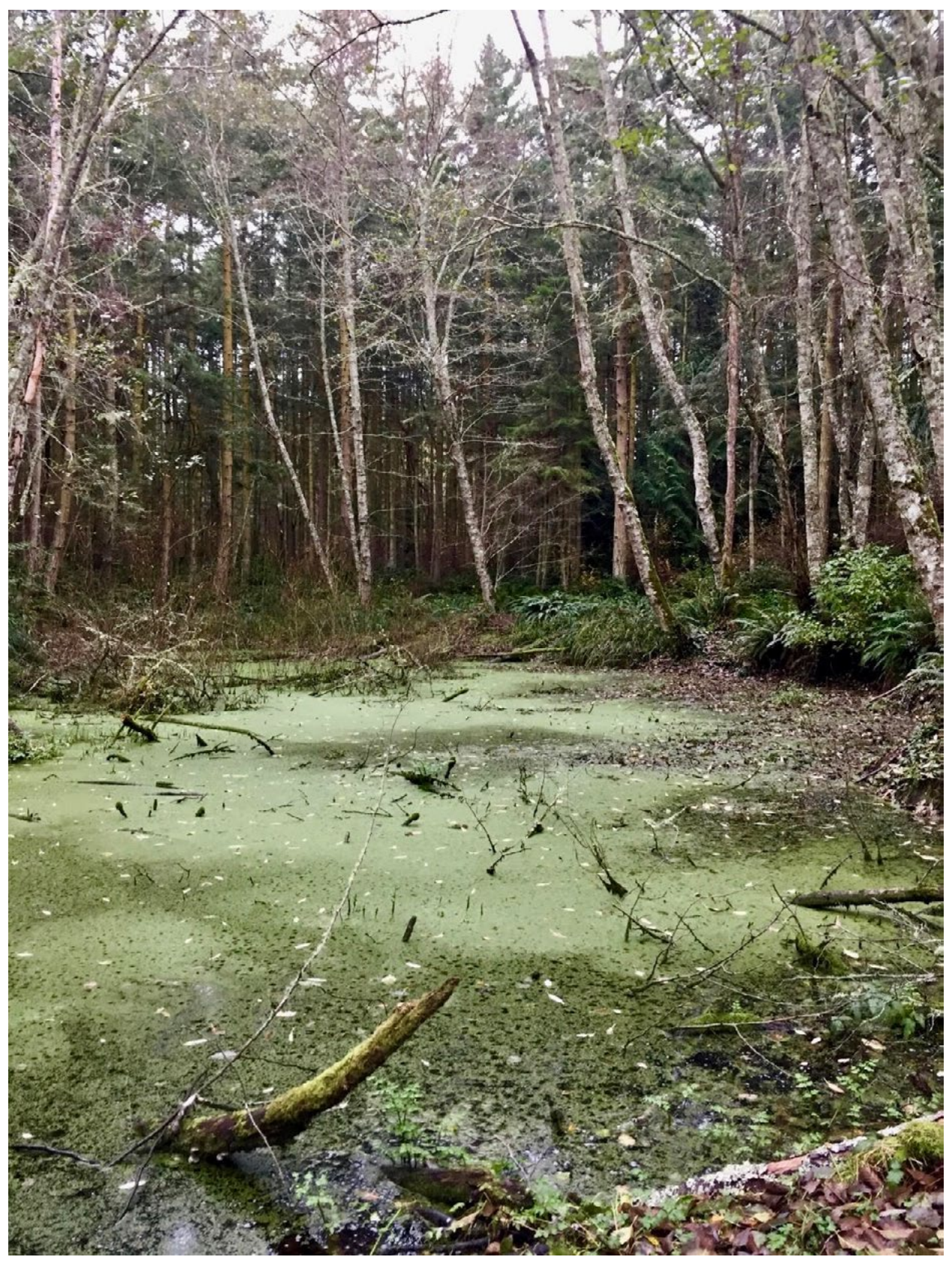
Figure 9. Ivy Street Wetland on the Olympic Peninsula's Quimper Wildlife Corridor. This pond is representative of other marshy areas where Coast Salish women harvested reeds and grasses.