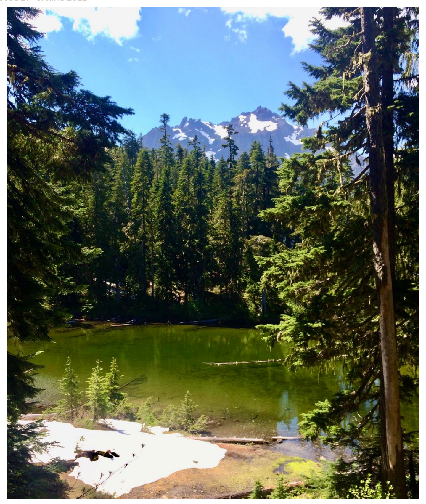
Figure 10. Harrison Lake, an alpine lake located within Washington's Buckhorn Wilderness. Alpine lakes created excellent growing conditions for tule reeds.