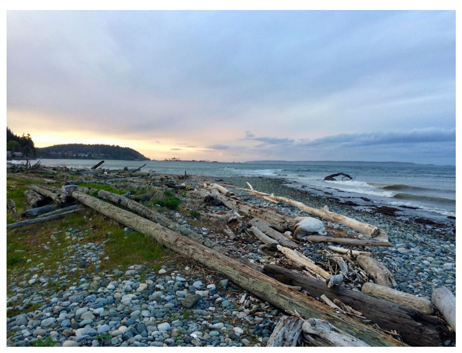
Figure 8. Point Hudson, a well-known camping spot for Indigenous individuals who were traveling to hop fields in search of work.

a rapidly changing world. Coast Salish women covertly altered traditional patterns of femininity and financial freedom while earning wages in settler society. Much of their success relied upon creatively retaining access to waterways. Doing so increased female mobility, facilitated trade and economic opportunities, and encouraged women's continued access to private property (in the form of crops and natural resources that were then transformed into material wealth, such as baskets).