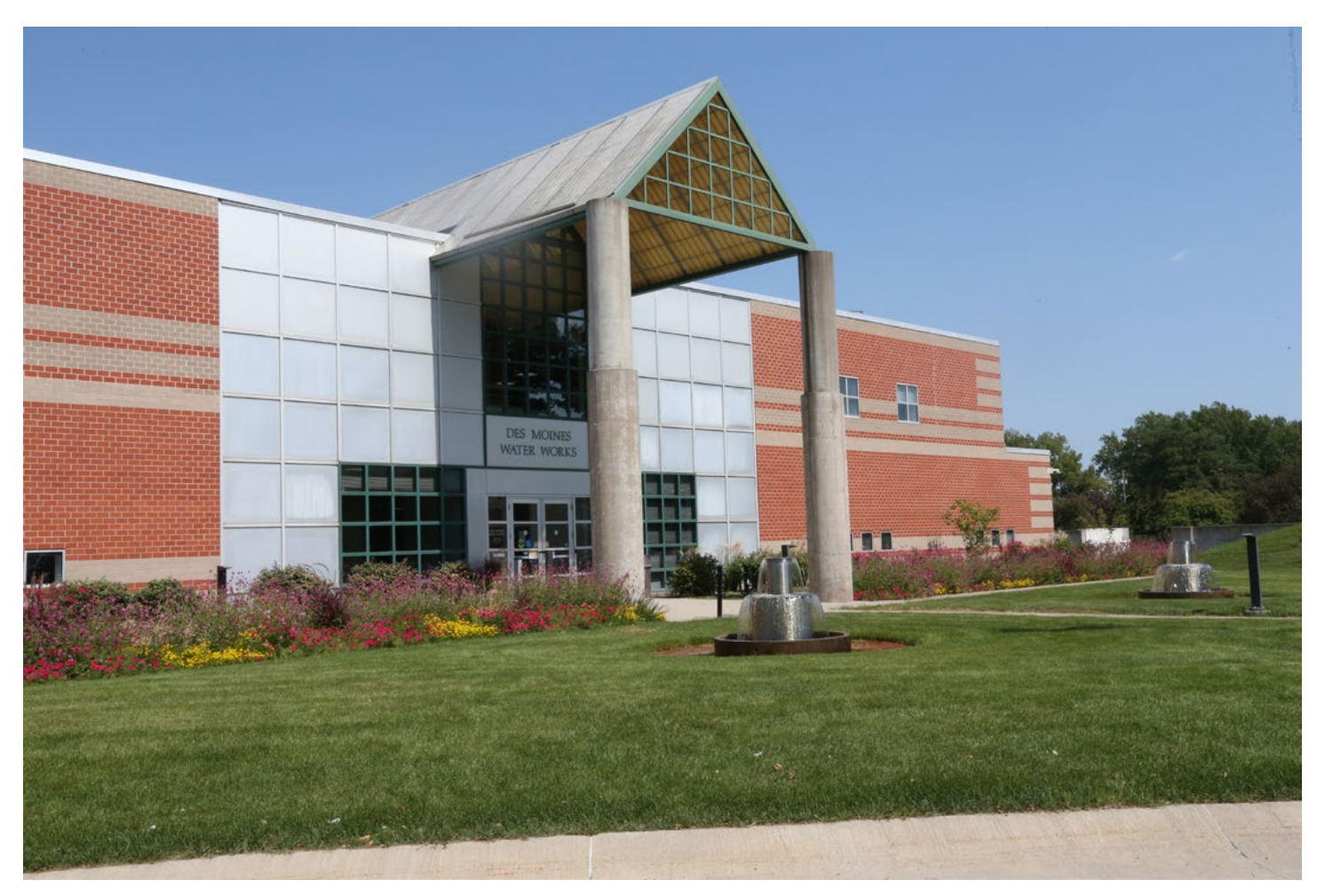
Des Moines Water Works provides safe, affordable drinking water to 600,000 central Iowans from three treatment sites, including one on the Raccoon River in Des Moines Water Works Park.

In the summer, I wonder if our drinking water utility customers will water their lawns all at once, and we'll need to issue a water shortage alert. I wonder if our customers will call and ask us why their water tastes like algae or ammonia on a particular day. I prepare for a flurry of