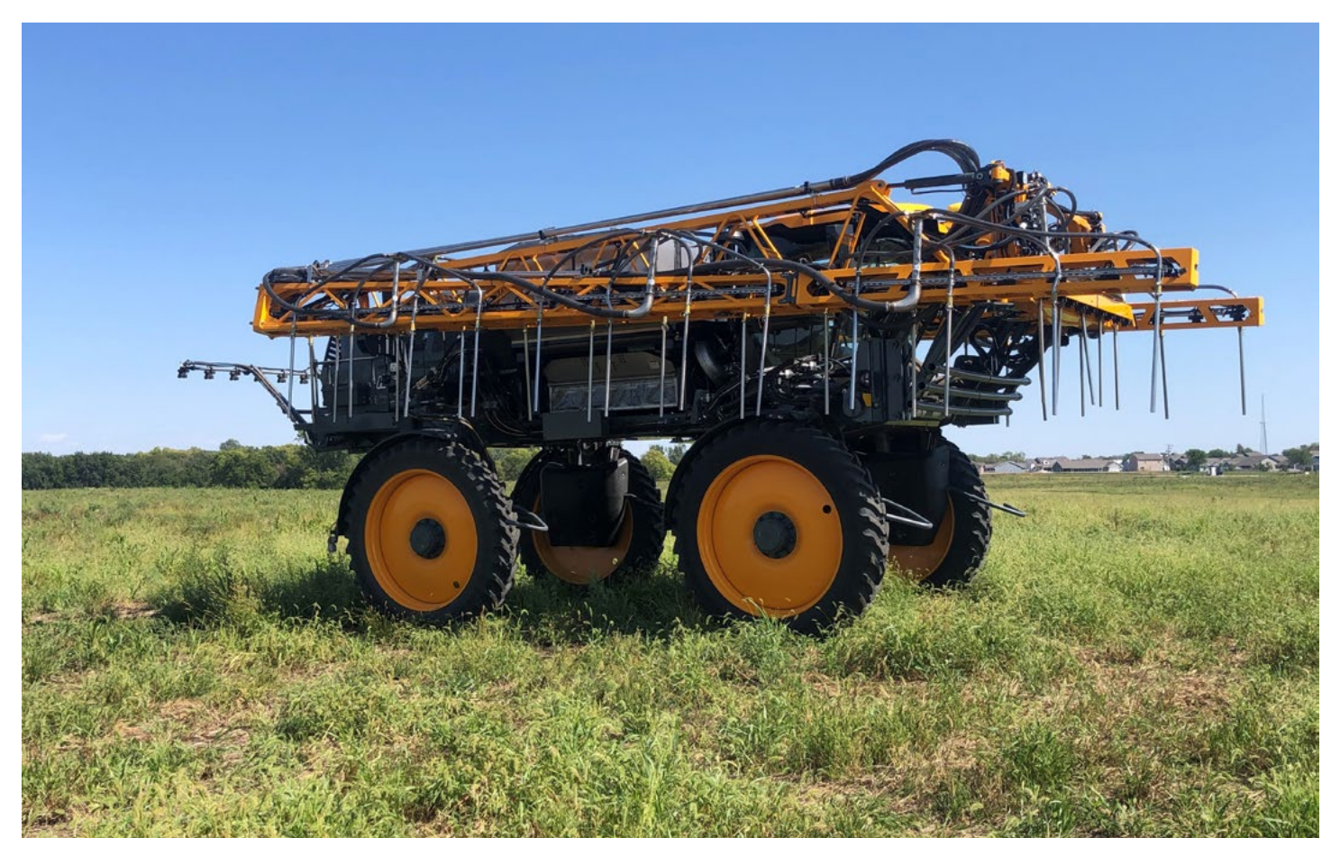
Des Moines Water Works collaborated with the City of Des Moines, Polk County, and the Iowa Department of Agriculture to purchase a U.S. $600,000 cover crop seeder. Heartland Co-op will lease the machine to farmers in hopes of increasing practice adoption to improve source water quality.

I have come to realize that an effective way to make change in the world of water is by thinking about this work in terms of a community—and I am one part of that community. My laser focus on drinking water is just one facet of the water quality work. I will use my finite amount of time and energy to seek partnerships with people whose focus is different from, but as important as, mine. I will work with people whom I trust, people who share my values. I choose to work