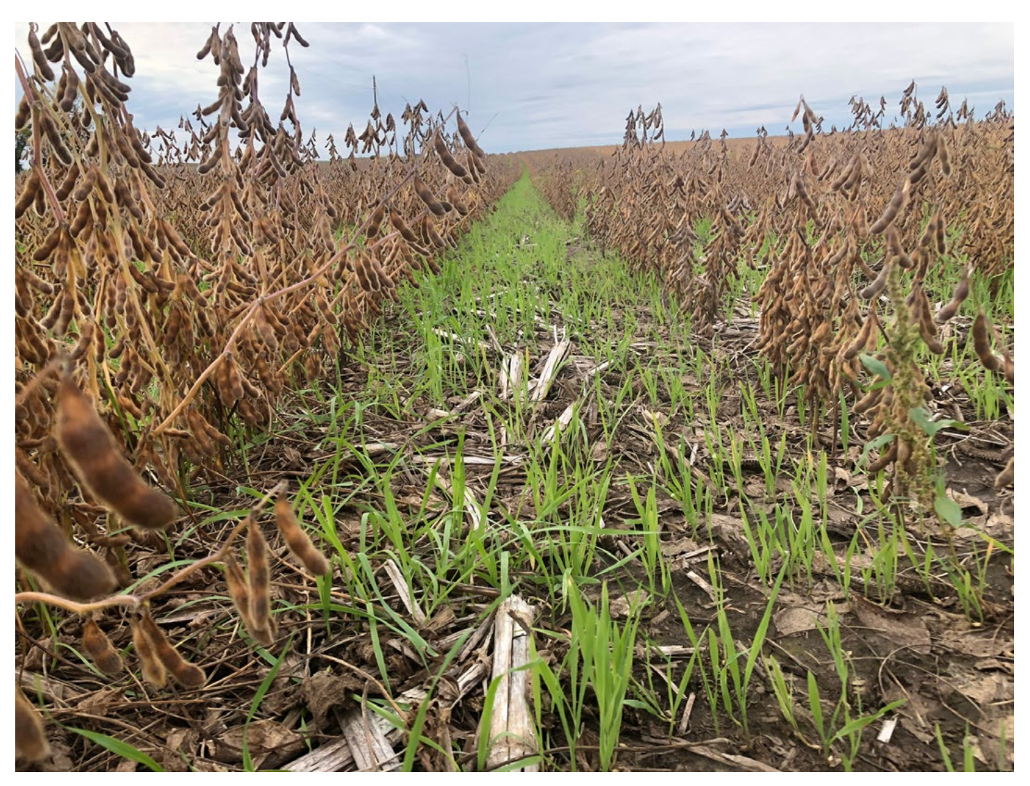
Reduced Tillage: The photo shows soybeans soon to be harvested in a no-till operation. There are still traces of corn stalks standing between the soybean rows from the previous year. Less disturbance of the soil reduces chances of erosion and promotes soil health.

Defining my role in our family operation, as well as working in a male-dominated industry, has inspired me to hold space for others who may feel separate from those at the table. I find I am better able to help landowners build out their own set of tools to address the specific concerns