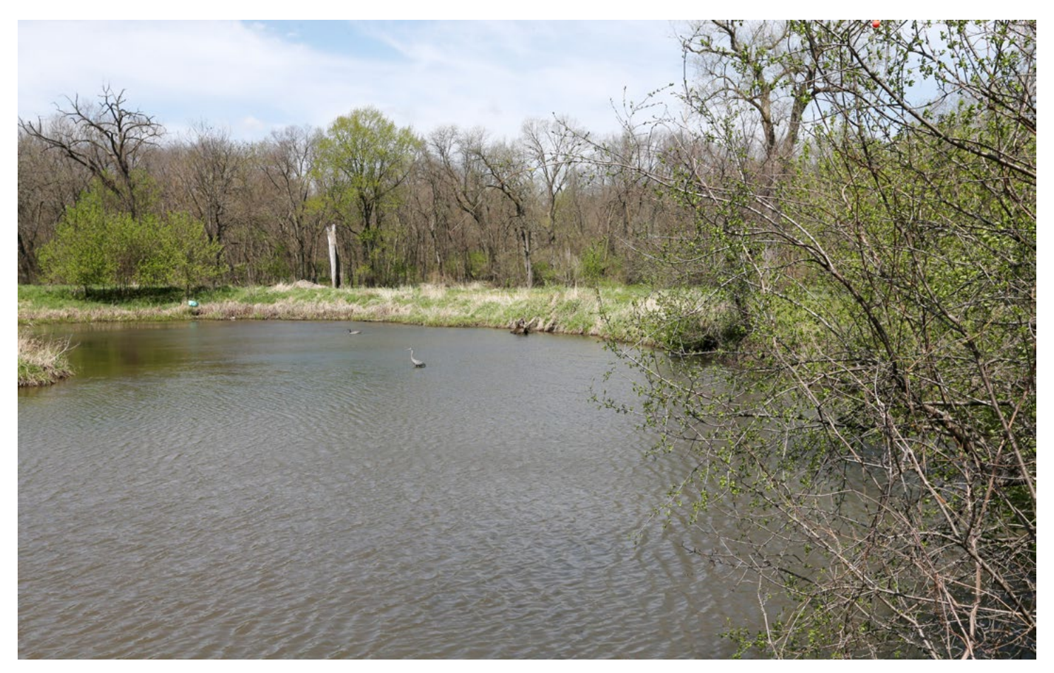
Des Moines Water Works engineering staff builds and maintains 1,000 miles of underground water mains and pipe and pumps lifesaving water to 10,000 fire hydrants across the Des Moines metro region. The utility has been serving the region for 101 years. Water quality has degraded the past few decades due to agricultural contaminants, making treatment of the river water to make it safe to drink more difficult. Ponds throughout Des Moines Water Works Park, a 1,500-acre urban recreational gem, help filter river water before it enters the treatment plant.

We're not afraid to think big or come up with new ideas to advance healthy land, clean water, and a strong social fabric in urban and rural Iowa. The creativity and tenacity required for projects like these is great, and our team is up for the challenge.