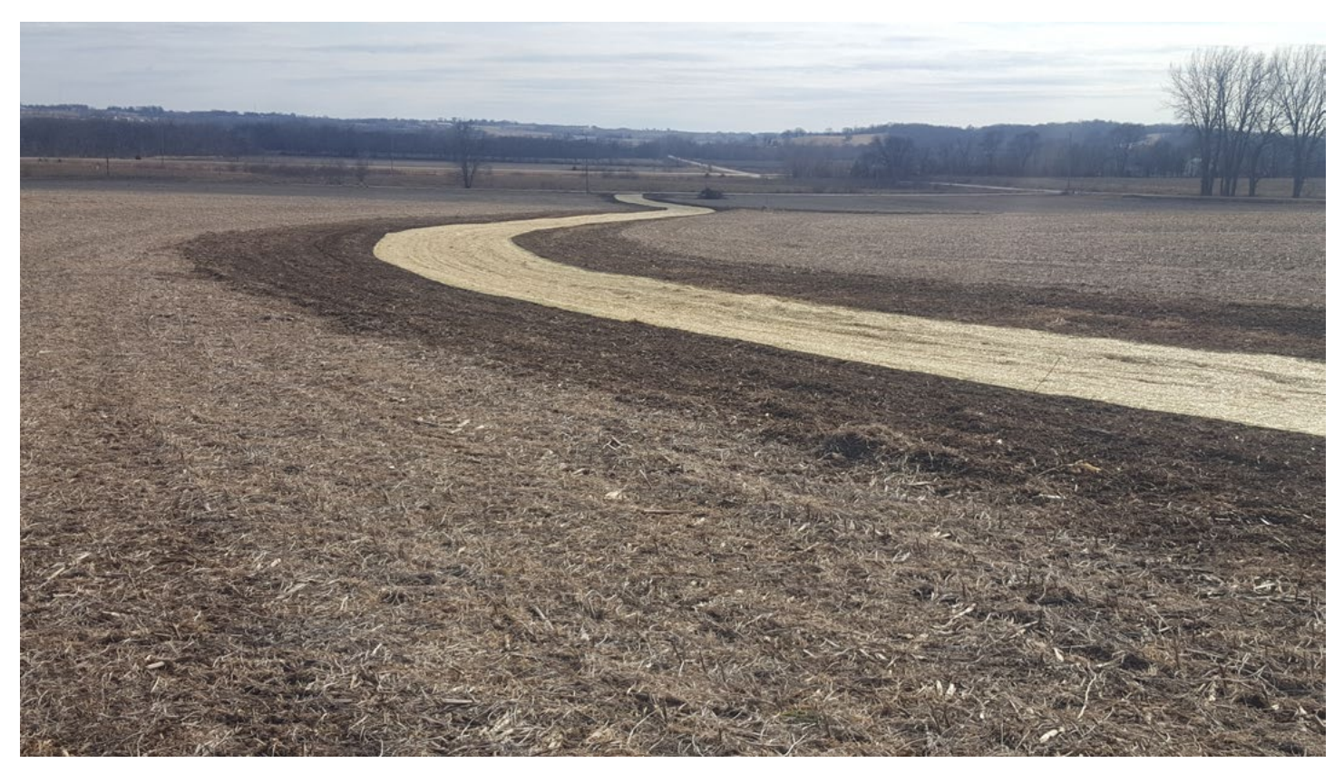
Grassed Waterway: Water needs a way to move off a farm after weather events, whether it is subsurface or above ground. Grassed waterways are purposefully shaped and planted with strong-rooted grasses to help channel water above ground. The lighter area in the photo has been shaped and planted with grass seed in straw mat to help with establishment.

When the landowner and tenant both focus on maximizing the most productive acres and protecting the environmentally sensitive acres of each farm, we change the relationship dynamic. Our ability to write an equitable lease and prioritize projects is enhanced; the tenant and landowner are both willing to invest in the farm because each see the value of the partnership.