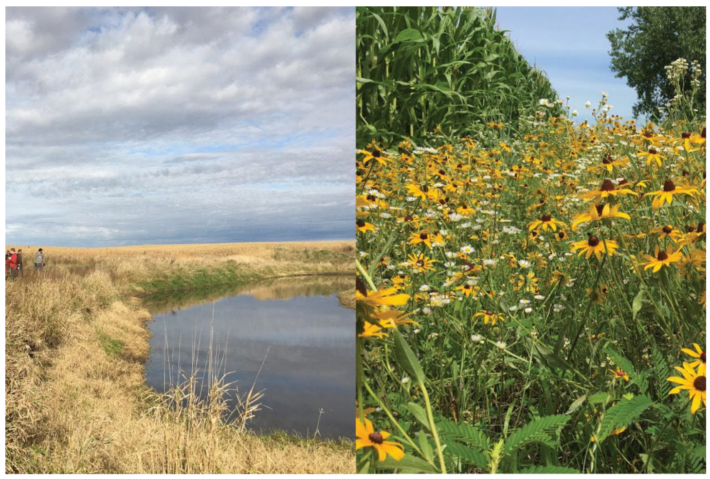
Left: Coordinators meeting at an oxbox in the river. Right: With corn growing on the left, the wildflowers in the filter strip provide valuable habitat, as well as filtering runoff from the fields.

agricultural achievements have come with significant environmental costs. The erosion of valuable topsoil leads to turbid rivers and lakes and threatens the long-term viability of our farms. Nutrient loss from farm fields leads to algae blooms and threatens the safety of our drinking water supplies. Iowans are increasingly clamoring for more aquatic recreational opportunities, but the water