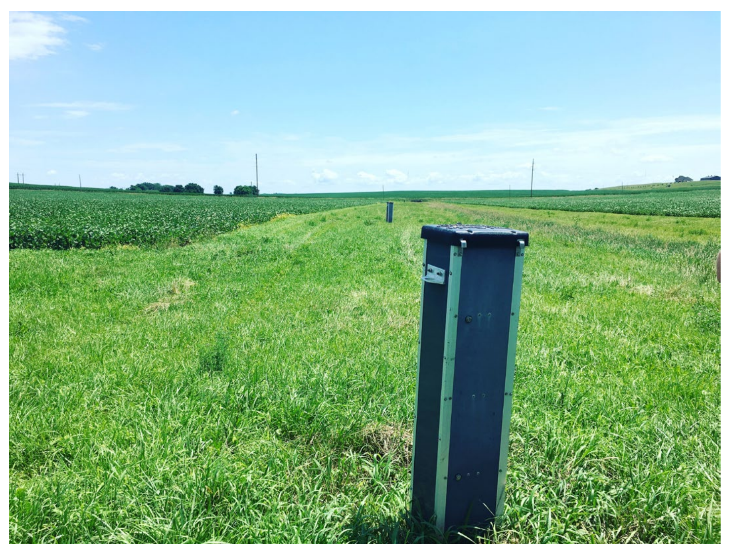
Saturated Buffers: Draining farmland with subsurface tile is critical to corn and soybean production in Iowa, and we are learning how to treat tile water before it leaves the farm. The control structures shown in the photo direct tile water to lateral lines running parallel to the drainage ditch to allow water to filter through the soil before entering the stream. When given the chance, living roots are a willing and efficient cleaner of water.

Where success is measured by practices implemented and true minds changed, we must embrace the web of interconnectedness of our work. We must embrace the synergies and hold space for those who are completing critical work versus committee efforts that have more marketing polish than actual results.