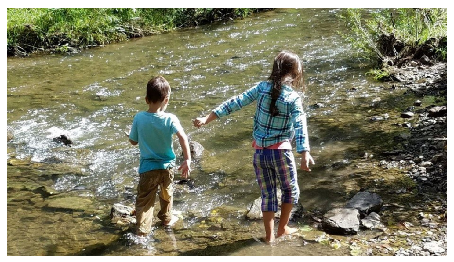
Protecting our watersheds safeguards drinking water supplies, reduces flooding, and allows for valuable recreation opportunities.

There is no how-to guide available on how cities can successfully work with their agricultural watershed neighbors. We all have to chart our own course and test out new strategies and partnerships. Not all partnerships and strategies have led to on-the-ground conservation success. In some ways, we have had to recalibrate our notion of what success looks like. Success can't always be measured based on water quality improvements alone (though that is certainly the end goal), and it definitely isn't measured by the amount of money we are throwing at the problem.