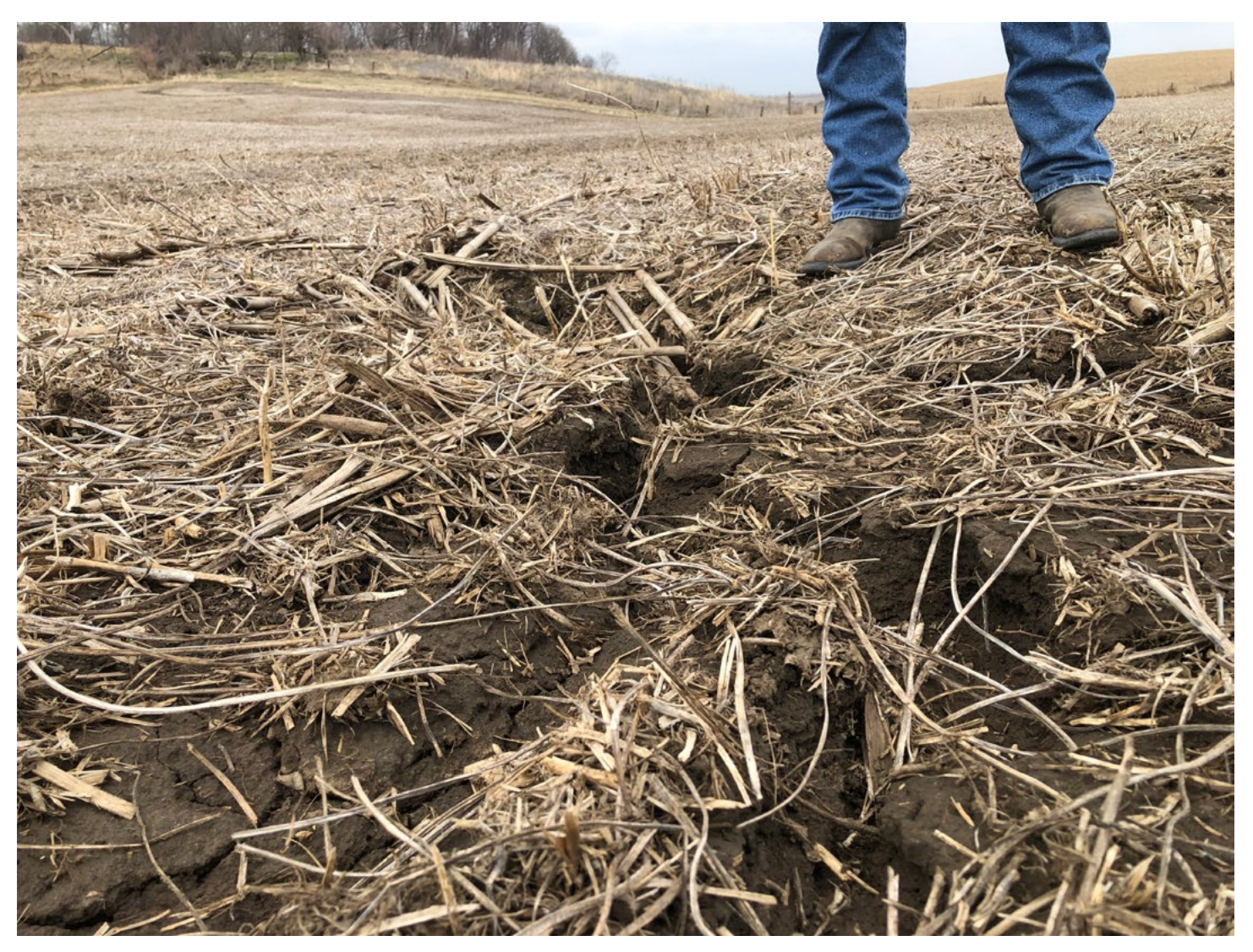
Example of soil erosion on a farm. Soil leaving the farm reduces return on investment for both landowner and farmer. The soil moving here may seem minimal in the grand scheme, but the damaging effects can multiply over time.

I help landowners and farmers work toward the shared goal of addressing soil health that improves productivity, protects long term value, and benefits our shared landscape. And my hope is that if I can help build the conservation ethic "muscle," then future heavy lifting brought by funding opportunities or policy changes will be easier and come more quickly.