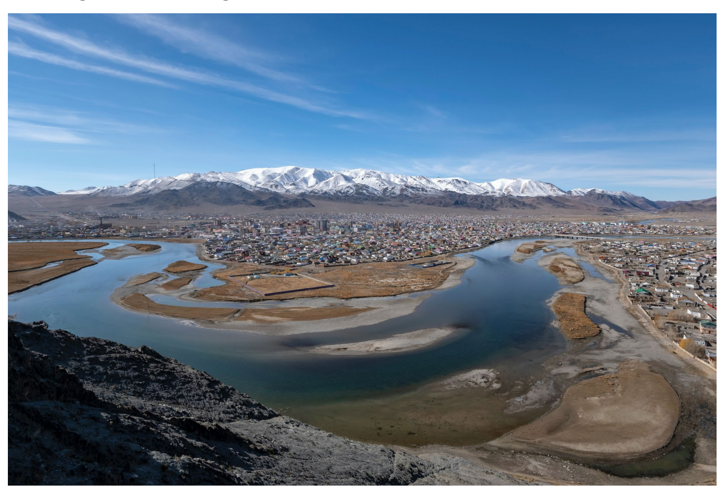
Between the Altai Mountains and the Khovd River, Ölgii is the capital of the Bayan-Ölgii Aimag province in western Mongolia.

We are privileged to be able to share this variety of powerful work with all of you and we are grateful to our authors, readers, peer reviewers, board members, partners, and staff for making