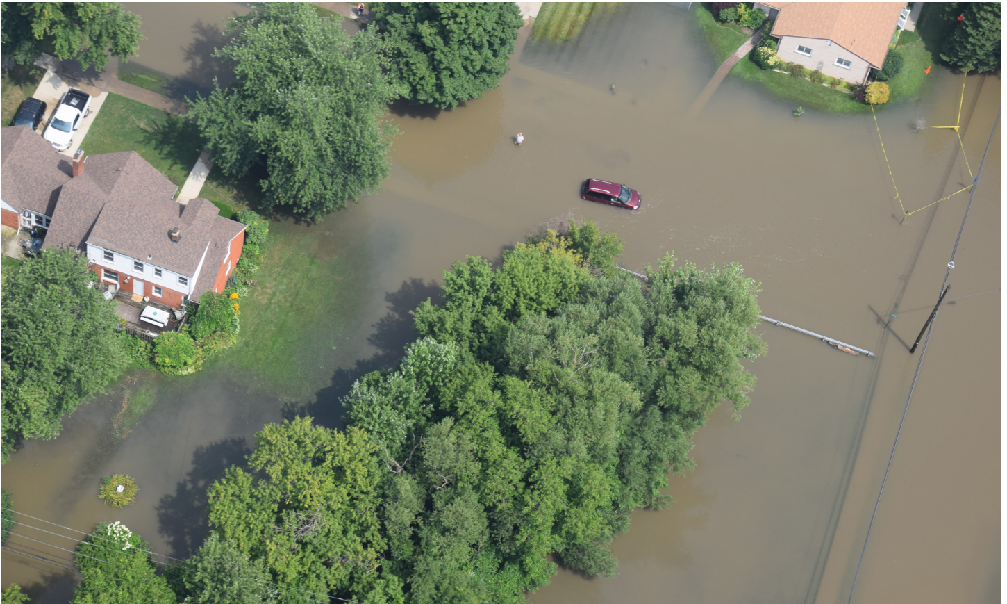
2014 flood in the Detroit metro area.

As the planet warms, severe rains – and the flooding that follows – may become even more intense and frequent in cities like Detroit that