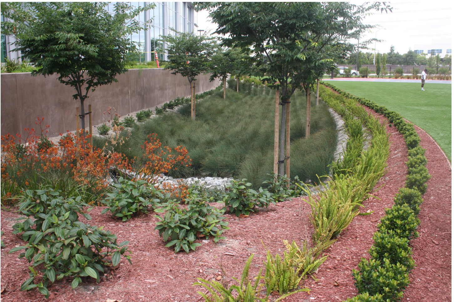
An engineered bioswale is a way to slow and filter stormwater using natural plants and soil and helps reduce flooding.

Stormwater engineers frequently refer to this as "nature-based interventions" or "green stormwater infrastructure."