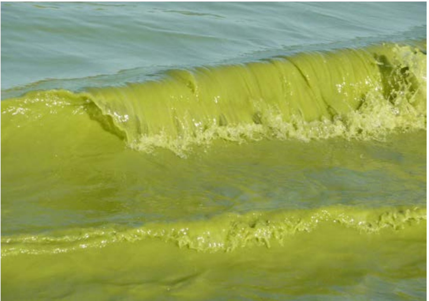
Harmful algae bloom. Pelee Island, Ohio. Lake Erie.

“Do Not Drink/Do Not Boil” is not what anyone wants to hear about their city’s tap water. But the combined effects of climate change and degraded water quality could make such warnings more frequent across the Great Lakes region.