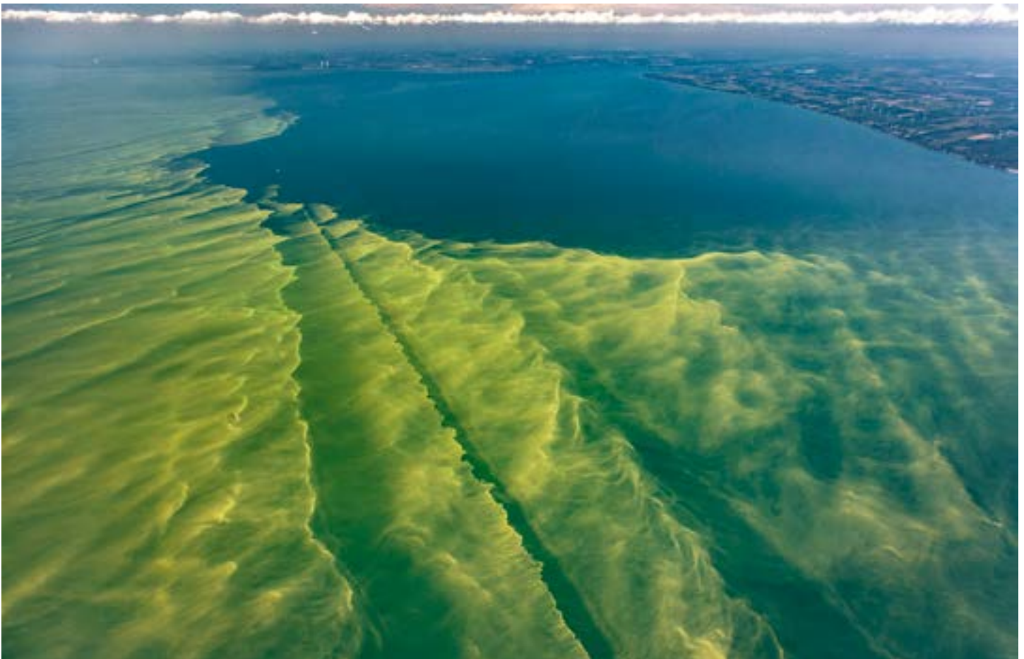
True color photo images of Lake Erie's harmful algal blooms on August 14, 2017.

As Midwesterners working in the fields of urban environmental health and climate and environmental science , we believe more crises like Toledo's could lie ahead if the region doesn't address looming threats to drinking water quality.